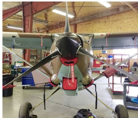
Siai Marchetti 1019 Engine Plugs, Prop Tie-Exhaust Covers