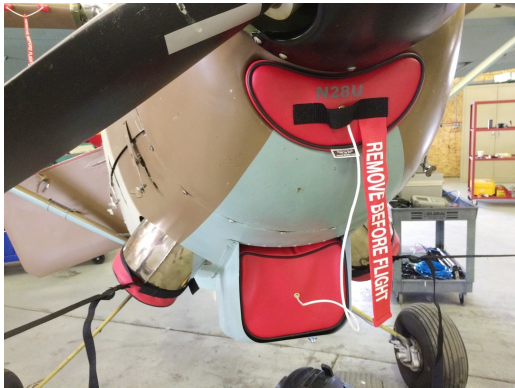
Siai Marchetti 1019 Engine Plugs, Prop Tie-Exhaust Covers