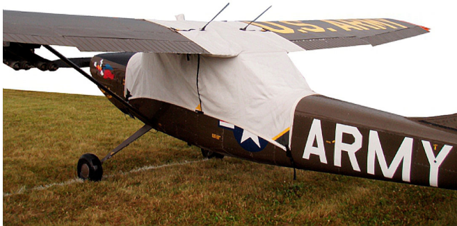
L-19 Canopy Cover (similar to Siai Marchetti 1019)

This cover type is made from Silver Acrylic Sunbrella canvas and is 100% lined with a soft and smooth microfiber. Bruce's Custom Covers developed this material combination especially for aircraft protection. The outer material is medium weight and treated for water resistance, UV resistance and anti-static buildup. The inner lining is a very soft and smooth microfiber to prevent scratching. The material is very reflective, and tests show that the cabin interior temperature can be reduced to near-ambient temperature on the hottest of days. It is water, ice and snow repellent, yet breathable to allow moisture to escape from between the cover and the aircraft surface.