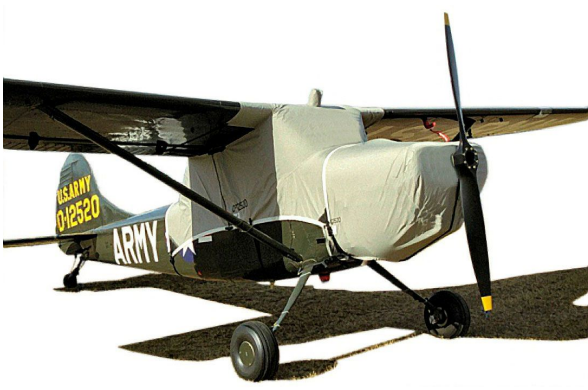
Cessna L-19 Canopy & Engine Covers (similar to Siai Marchetti 1019)