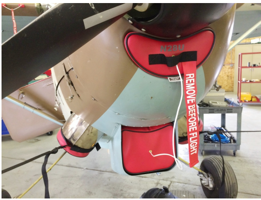
Siai Marchetti 1019 Engine Plugs, Prop Tie-Exhaust Covers