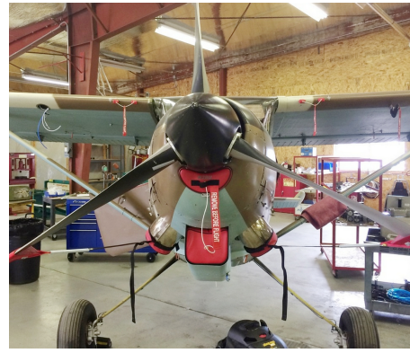
Siai Marchetti 1019 Engine Plugs, Prop Tie-Exhaust Covers