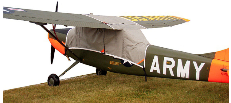
L-19 Canopy Cover (similar to Siai Marchetti 1019)