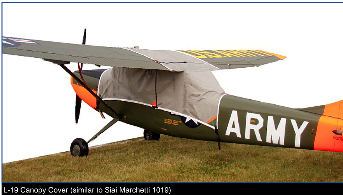
L-19 Canopy Cover (similar to Siai Marchetti 1019)