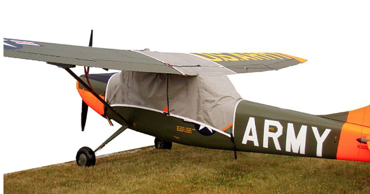
L-19 Canopy Cover (similar to Siai Marchetti 1019)

This cover type is made from Silver Acrylic Sunbrella canvas and is 100% lined with a soft and smooth microfiber. Bruce's Custom Covers developed this material combination especially for aircraft protection. The outer material is medium weight and treated for water resistance, UV resistance and anti-static buildup. The inner lining is a very soft and smooth microfiber to prevent scratching. The material is very reflective, and tests show that the cabin interior temperature can be reduced to near-ambient temperature on the hottest of days. It is water, ice and snow repellent, yet breathable to allow moisture to escape from between the cover and the aircraft surface.