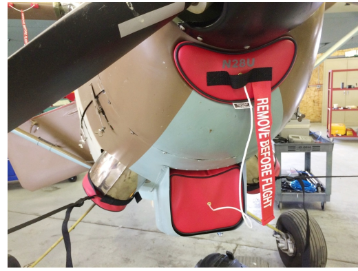
Siai Marchetti 1019 Engine Plugs, Prop Tie-Exhaust Covers