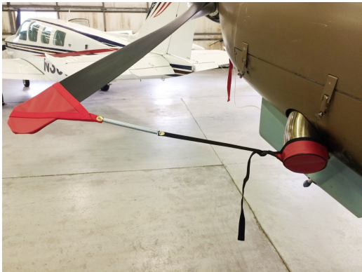
Siai Marchetti 1019 Prop Tie-Exhaust Covers

This cover type is made from Silver Acrylic Sunbrella canvas and is 100% lined with a soft and smooth microfiber. Bruce's Custom Covers developed this material combination especially for aircraft protection. The outer material is medium weight and treated for water resistance, UV resistance and anti-static buildup. The inner lining is a very soft and smooth microfiber to prevent scratching. The material is very reflective, and tests show that the cabin interior temperature can be reduced to near-ambient temperature on the hottest of days. It is water, ice and snow repellent, yet breathable to allow moisture to escape from between the cover and the aircraft surface.