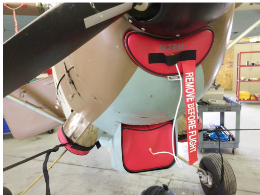
Siai Marchetti 1019 Engine Plugs, Prop Tie-Exhaust Covers

This cover type is made from Silver Acrylic Sunbrella canvas and is 100% lined with a soft and smooth microfiber. Bruce's Custom Covers developed this material combination especially for aircraft protection. The outer material is medium weight and treated for water resistance, UV resistance and anti-static buildup. The inner lining is a very soft and smooth microfiber to prevent scratching. The material is very reflective, and tests show that the cabin interior temperature can be reduced to near-ambient temperature on the hottest of days. It is water, ice and snow repellent, yet breathable to allow moisture to escape from between the cover and the aircraft surface.