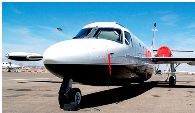
Westwind Engine Cover Set, Pitot Cover