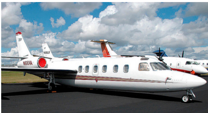
Westwind Engine Intake Plugs

The Engine Inlet Plugs are custom fit for your Israel Aircraft Industries Jet Commander 1121 intakes, made with heavy-duty vinyl material, and stuffed with a single block of sculpted urethane foam. Each plug has a zipper that allows the foam to be removed and dried if necessary. Engine plugs have 'remove before flight' streamers sewn onto the face of the plugs. Most plugs are imprinted with the aircraft registration number in black for an extra charge. Storage bag NOT included. Engine plugs may be inserted after flight when the engine is still warm. Engine Inlet Plugs are commonly referred to as Cowl Plugs, Intake Plugs, Cowl Blocks, Engine Blocks, and Engine Bungs.