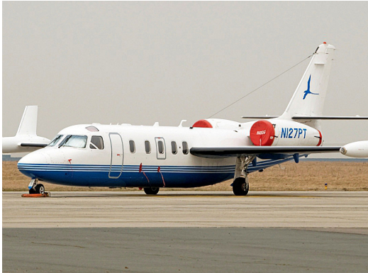
Engine Covers & Cockpit HeatShields