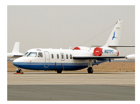
Engine Covers & Cockpit HeatShields

The Israel Aircraft Westwind 1123 Bikini Style Engine Covers are a single-piece design using a soft and smooth stretchy and fabric. The cover stretches tightly over both the intake and exhaust, installing quickly and easily. These covers are designed to be used as hangar dust covers and have a useful life of approximately one year.