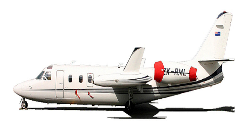
Jet Commander Engine Covers