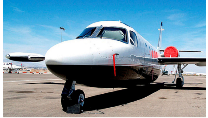
Westwind Engine Cover Set, Pitot Cover