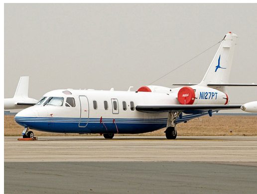
Engine Covers & Cockpit HeatShields

Cockpit Heatshields are interior sunshades for the aircraft's cockpit. The product is a unique composite of closed-cell foam with a silver mylar finish. The semi-rigid design is stiff enough to stand inside the window framing. The set folds up flat and is easily stored in the included storage sleeve. Some designs may require velcro and suction cups. Our Heatshields for jets are offered white side out because some aircraft manufacturers have issued advisories against reflective window inserts due to potential heat damage. A Heatshield is an excellent short-term remedy for cockpit overheating, but an external fabric cover is more effective for long-term protection.