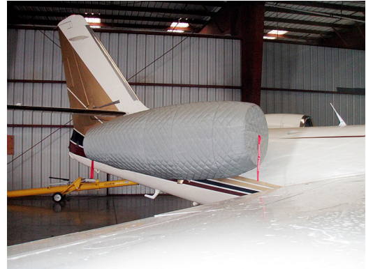
IAI Westwind Insulated Engine Nacelle Cover