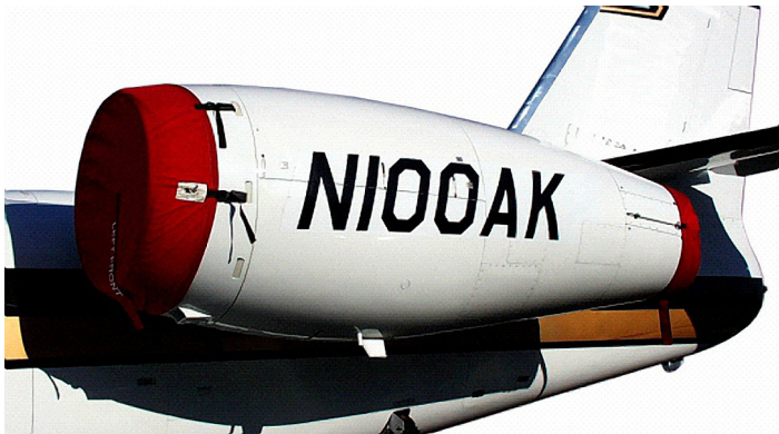
IAI Astra Engine Cover Set