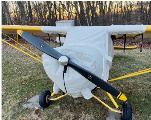
Aeronca Chief 11AC, Super Chief 11CC Insulated Engine Cover

This cover type is made from Silver Acrylic Sunbrella canvas and is 100% lined with a soft and smooth microfiber. Bruce's Custom Covers developed this material combination especially for aircraft protection. The outer material is medium weight and treated for water resistance, UV resistance and anti-static buildup. The inner lining is a very soft and smooth microfiber to prevent scratching. The material is very reflective, and tests show that the cabin interior temperature can be reduced to near-ambient temperature on the hottest of days. It is water, ice and snow repellent, yet breathable to allow moisture to escape from between the cover and the aircraft surface.