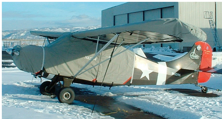
Extended Canopy Cover, Engine & Wing Covers