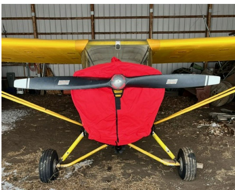
Aeronca 11AC Chief Insulated Engine Cover

This cover type is made from Silver Acrylic Sunbrella canvas and is 100% lined with a soft and smooth microfiber. Bruce's Custom Covers developed this material combination especially for aircraft protection. The outer material is medium weight and treated for water resistance, UV resistance and anti-static buildup. The inner lining is a very soft and smooth microfiber to prevent scratching. The material is very reflective, and tests show that the cabin interior temperature can be reduced to near-ambient temperature on the hottest of days. It is water, ice and snow repellent, yet breathable to allow moisture to escape from between the cover and the aircraft surface.