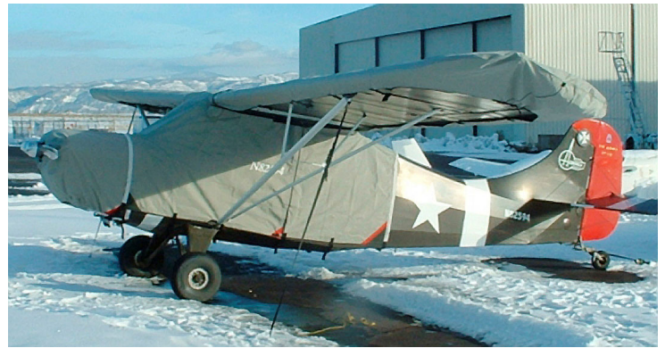
Extended Canopy Cover, Engine & Wing Covers