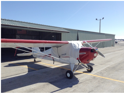
Aeronca Chief Canopy Cover

This cover type is made from Silver Acrylic Sunbrella canvas and is 100% lined with a soft and smooth microfiber. Bruce's Custom Covers developed this material combination especially for aircraft protection. The outer material is medium weight and treated for water resistance, UV resistance and anti-static buildup. The inner lining is a very soft and smooth microfiber to prevent scratching. The material is very reflective, and tests show that the cabin interior temperature can be reduced to near-ambient temperature on the hottest of days. It is water, ice and snow repellent, yet breathable to allow moisture to escape from between the cover and the aircraft surface.