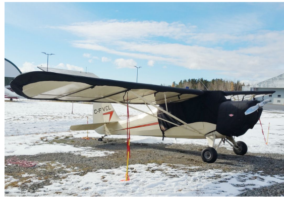
Aeronca Chief 11AC Canopy, Insulated Engine, & Wing Covers