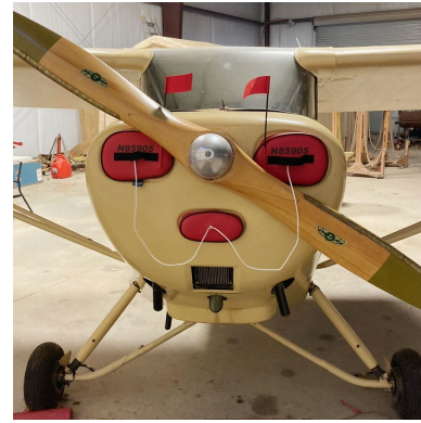
Aeronca 11AC Engine Inlet Plugs