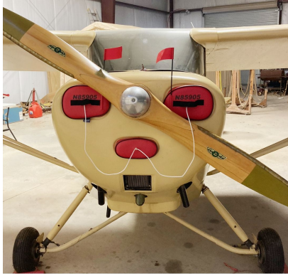
Aeronca 11AC Chief Engine Plugs

Engine Inlet Plugs are custom fit for your Aeronca Chief 11AC, Super Chief 11CC intakes, made with heavy-duty vinyl material, and stuffed with a single block of sculpted urethane foam. Each plug has a zipper that allows the foam to be removed and dried if necessary. Engine plugs have warning flags that are visible from the cockpit or 'remove before flight' streamers sewn onto the face of the plugs. Most plugs are imprinted with the aircraft registration number in black for an extra charge. Storage bag NOT included. Engine plugs may be inserted after flight when the engine is still warm. Engine Inlet Plugs are commonly referred to as Cowl Plugs, Intake Plugs, Cowl Blocks, Engine Blocks, and Engine Bungs.