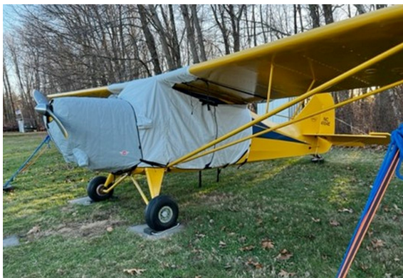
Aeronca Super Chief 11CC Extended Over-Top Canopy Cover, Insulated Engine Cover

This cover type is made from Silver Acrylic Sunbrella canvas and is 100% lined with a soft and smooth microfiber. Bruce's Custom Covers developed this material combination especially for aircraft protection. The outer material is medium weight and treated for water resistance, UV resistance and anti-static buildup. The inner lining is a very soft and smooth microfiber to prevent scratching. The material is very reflective, and tests show that the cabin interior temperature can be reduced to near-ambient temperature on the hottest of days. It is water, ice and snow repellent, yet breathable to allow moisture to escape from between the cover and the aircraft surface.