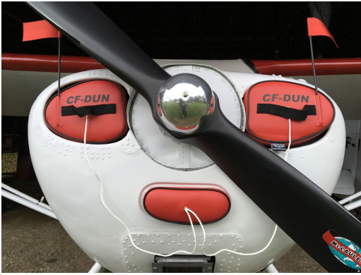
Aeronca 11AC Engine Inlet Plugs

Engine Inlet Plugs are custom fit for your Aeronca Chief 11AC, Super Chief 11CC intakes, made with heavy-duty vinyl material, and stuffed with a single block of sculpted urethane foam. Each plug has a zipper that allows the foam to be removed and dried if necessary. Engine plugs have warning flags that are visible from the cockpit or 'remove before flight' streamers sewn onto the face of the plugs. Most plugs are imprinted with the aircraft registration number in black for an extra charge. Storage bag NOT included. Engine plugs may be inserted after flight when the engine is still warm. Engine Inlet Plugs are commonly referred to as Cowl Plugs, Intake Plugs, Cowl Blocks, Engine Blocks, and Engine Bungs.