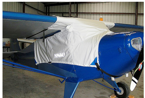
Taylorcraft BC12-D Over-the-top Canopy Cover