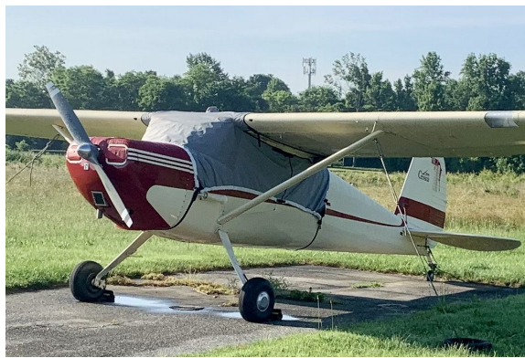
Cessna 140 Travel Weight Canopy Cover