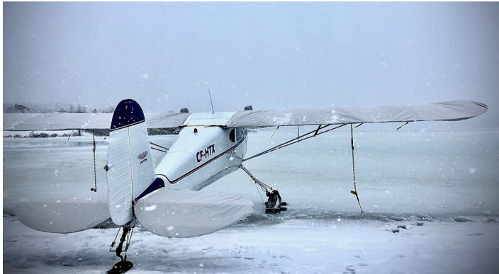
Cessna 140 Wing & Tail Covers

WINTER USE MATERIAL - Made with Solution-Dyed Polyester fabric, this option is intended for seasonal use to aid in deicing, rain mitigation, or for occasional travel. The material is lighter and more compact, but more susceptible to UV damage and may have a shorter useful life if used continuously outside than the all-year use material.