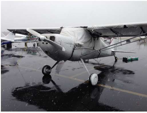
Cessna 120/140 Canopy and Wing Covers