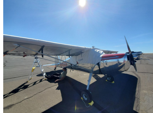
Cessna 140 Over The Top Style Canopy Cover