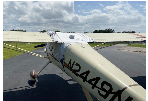
Cessna 140 Over-Top Canopy Cover