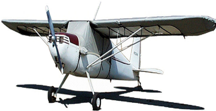
Cessna 120 Canopy Cover & Wing Covers

This cover type is made from Silver Acrylic Sunbrella canvas and is 100% lined with a soft and smooth microfiber. Bruce's Custom Covers developed this material combination especially for aircraft protection. The outer material is medium weight and treated for water resistance, UV resistance and anti-static buildup. The inner lining is a very soft and smooth microfiber to prevent scratching. The material is very reflective, and tests show that the cabin interior temperature can be reduced to near-ambient temperature on the hottest of days. It is water, ice and snow repellent, yet breathable to allow moisture to escape from between the cover and the aircraft surface.