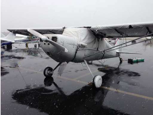
Cessna 120/140 Canopy and Wing Covers

WINTER USE MATERIAL - Made with Solution-Dyed Polyester fabric, this option is intended for seasonal use to aid in deicing, rain mitigation, or for occasional travel. The material is lighter and more compact, but more susceptible to UV damage and may have a shorter useful life if used continuously outside than the all-year use material.