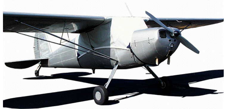
Cessna 120 Over-Top Canopy Cover