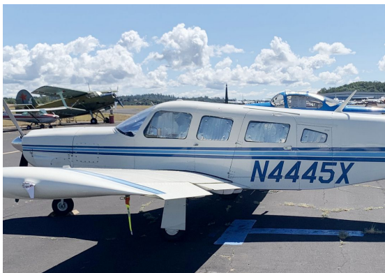
Piper PA32-300 HeatShield Set

This cover type is made from Silver Acrylic Sunbrella canvas and is 100% lined with a soft and smooth microfiber. Bruce's Custom Covers developed this material combination especially for aircraft protection. The outer material is medium weight and treated for water resistance, UV resistance and anti-static buildup. The inner lining is a very soft and smooth microfiber to prevent scratching. The material is very reflective, and tests show that the cabin interior temperature can be reduced to near-ambient temperature on the hottest of days. It is water, ice and snow repellent, yet breathable to allow moisture to escape from between the cover and the aircraft surface.