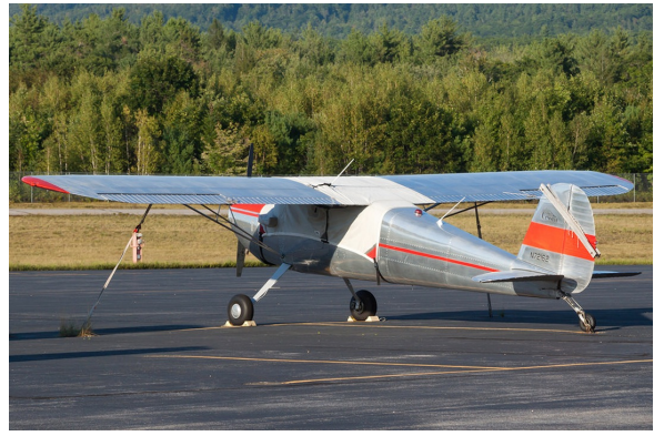
Cessna 140 Over-Top Canopy Cover