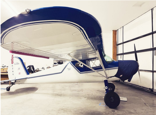
Cessna 140 Insulated Engine Cover

This cover type is made from Silver Acrylic Sunbrella canvas and is 100% lined with a soft and smooth microfiber. Bruce's Custom Covers developed this material combination especially for aircraft protection. The outer material is medium weight and treated for water resistance, UV resistance and anti-static buildup. The inner lining is a very soft and smooth microfiber to prevent scratching. The material is very reflective, and tests show that the cabin interior temperature can be reduced to near-ambient temperature on the hottest of days. It is water, ice and snow repellent, yet breathable to allow moisture to escape from between the cover and the aircraft surface.