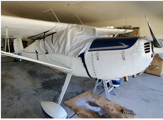
Cessna 140 Canopy Cover, Over Top Type, extends to cover gas caps