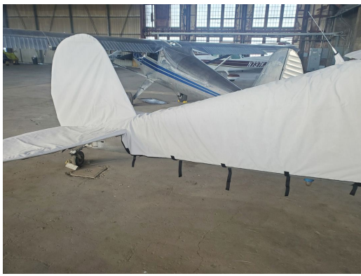
Cessna 140 Empennage Cover