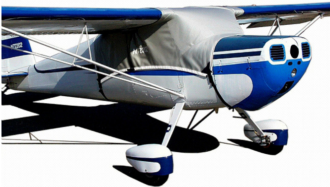
Cessna 120 Over-Top Canopy Cover

This cover type is made from Silver Acrylic Sunbrella canvas and is 100% lined with a soft and smooth microfiber. Bruce's Custom Covers developed this material combination especially for aircraft protection. The outer material is medium weight and treated for water resistance, UV resistance and anti-static buildup. The inner lining is a very soft and smooth microfiber to prevent scratching. The material is very reflective, and tests show that the cabin interior temperature can be reduced to near-ambient temperature on the hottest of days. It is water, ice and snow repellent, yet breathable to allow moisture to escape from between the cover and the aircraft surface.