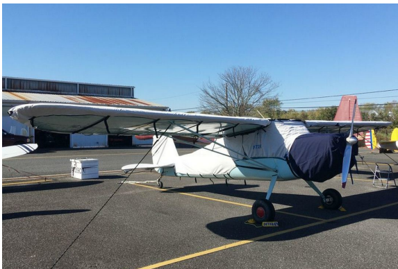
Cessna 140 Insulated Engine, Canopy, Empennage & Wing Covers

This cover type is made from Silver Acrylic Sunbrella canvas and is 100% lined with a soft and smooth microfiber. Bruce's Custom Covers developed this material combination especially for aircraft protection. The outer material is medium weight and treated for water resistance, UV resistance and anti-static buildup. The inner lining is a very soft and smooth microfiber to prevent scratching. The material is very reflective, and tests show that the cabin interior temperature can be reduced to near-ambient temperature on the hottest of days. It is water, ice and snow repellent, yet breathable to allow moisture to escape from between the cover and the aircraft surface.