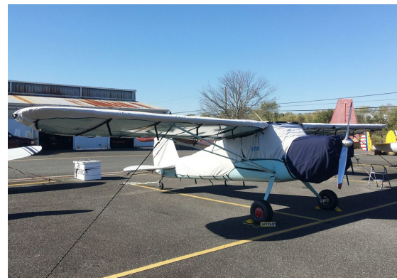
Cessna 140 Canopy, Engine, Wing & Empennage Covers