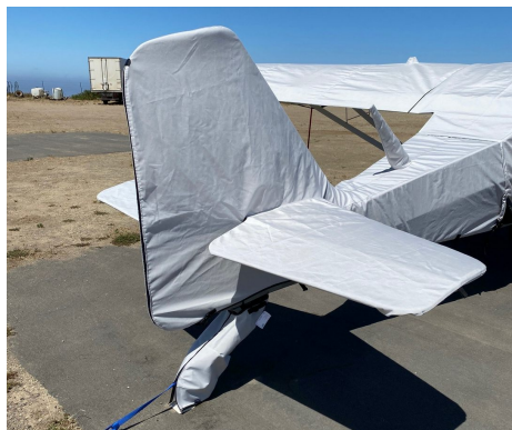
Kitfox Full Cover Set

ALL-YEAR USE MATERIAL - Made with Silver Acrylic Sunbrella canvas, the all-year use material is the best option for sun protection and cover longevity. This heavier more durable material is intended for all weather conditions, such as rain and snow or lots of sun.