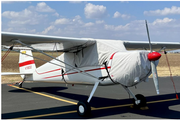
Cessna 140 Canopy Cover & Engine Cover