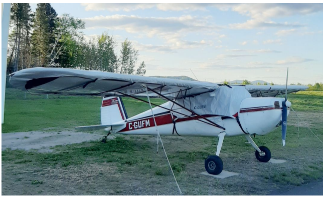
Cessna 140 Canopy Cover (Over-Top Type), Wing Covers