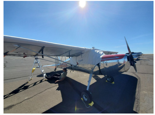
Cessna 140 Over The Top Style Canopy Cover