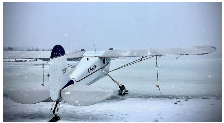
Cessna 140 Wing & Tail Covers