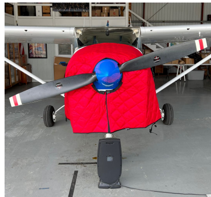
Insulated Hangar Blanket on Cessna 182