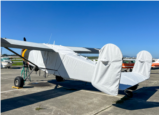
Max Holste 1521 Broussard Extended Canopy & Empennage Covers

This cover type is made from Silver Acrylic Sunbrella canvas and is 100% lined with a soft and smooth microfiber. Bruce's Custom Covers developed this material combination especially for aircraft protection. The outer material is medium weight and treated for water resistance, UV resistance and anti-static buildup. The inner lining is a very soft and smooth microfiber to prevent scratching. The material is very reflective, and tests show that the cabin interior temperature can be reduced to near-ambient temperature on the hottest of days. It is water, ice and snow repellent, yet breathable to allow moisture to escape from between the cover and the aircraft surface.