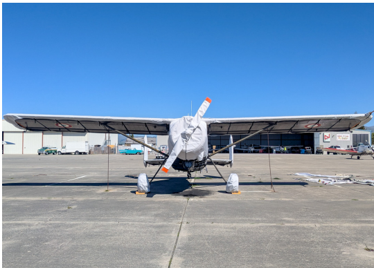
Max Holste 1521 Broussard Complete Cover Set