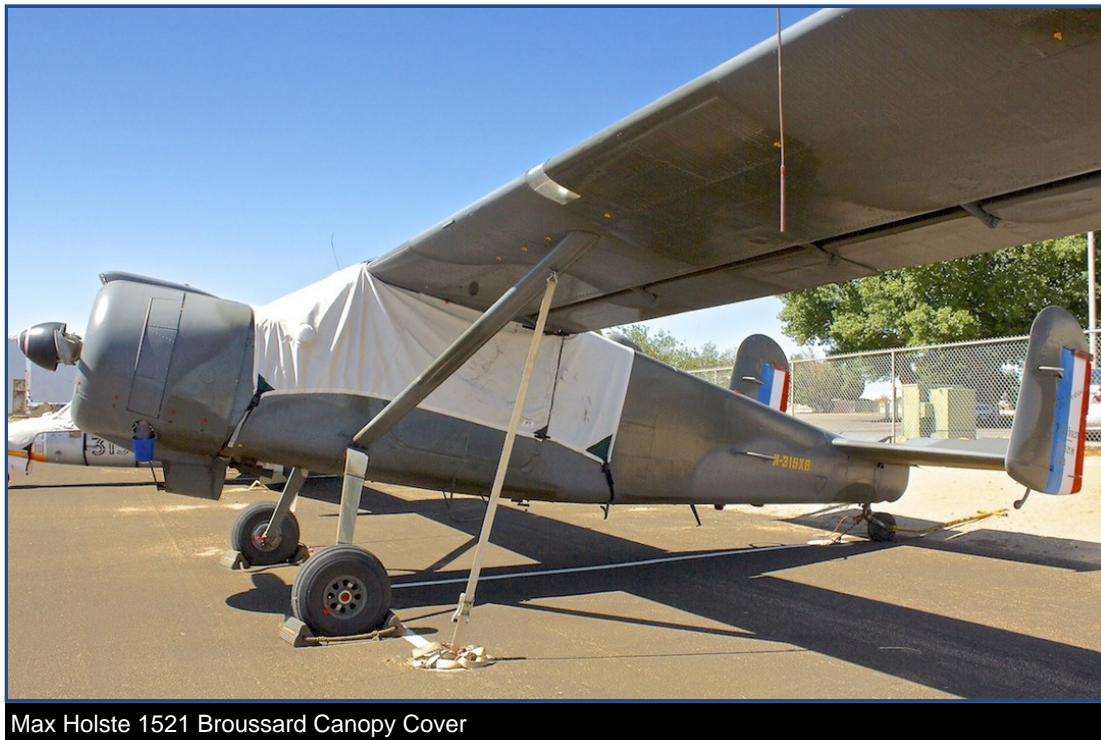
Max Holste 1521 Broussard Canopy Cover