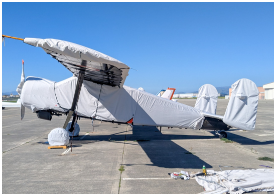
Max Holste 1521 Broussard Complete Cover Set

This cover type is made from Silver Acrylic Sunbrella canvas and is 100% lined with a soft and smooth microfiber. Bruce's Custom Covers developed this material combination especially for aircraft protection. The outer material is medium weight and treated for water resistance, UV resistance and anti-static buildup. The inner lining is a very soft and smooth microfiber to prevent scratching. The material is very reflective, and tests show that the cabin interior temperature can be reduced to near-ambient temperature on the hottest of days. It is water, ice and snow repellent, yet breathable to allow moisture to escape from between the cover and the aircraft surface.