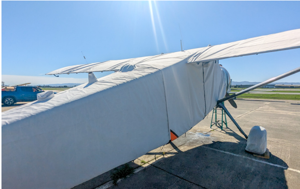
Max Holste 1521 Broussard Complete Cover Set

WINTER USE MATERIAL - Made with Solution-Dyed Polyester fabric, this option is intended for seasonal use to aid in deicing, rain mitigation, or for occasional travel. The material is lighter and more compact, but more susceptible to UV damage and may have a shorter useful life if used continuously outside than the all-year use material.