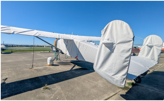
Max Holste 1521 Broussard Complete Cover Set