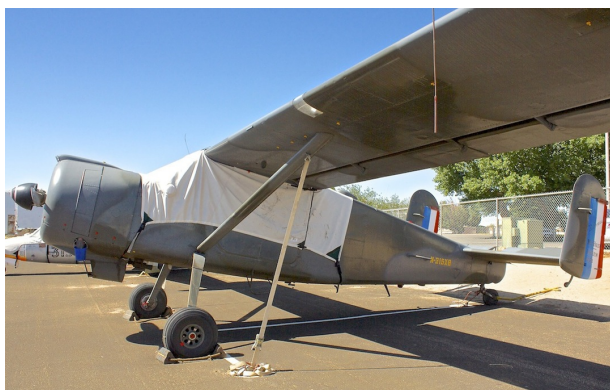
Max Holste 1521 Broussard Canopy Cover