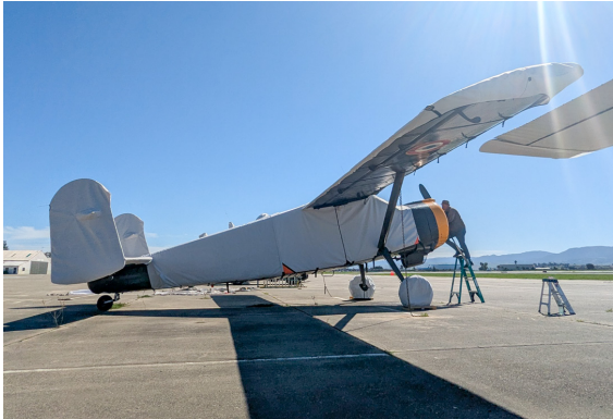
Max Holste 1521 Broussard Complete Cover Set