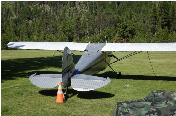
Cessna 170 Wing Covers (1948, Fabric Type, Round Tip), All Year Use

WINTER USE MATERIAL - Made with Solution-Dyed Polyester fabric, this option is intended for seasonal use to aid in deicing, rain mitigation, or for occasional travel. The material is lighter and more compact, but more susceptible to UV damage and may have a shorter useful life if used continuously outside than the all-year use material.