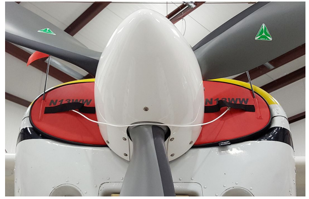
Cessna 180/185 Skywagon Engine Inlet Plugs