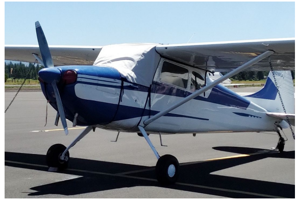
Cessna 170 Windshield Cover