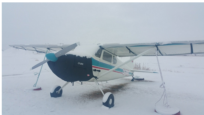
Cessna 170 Insulated Engine Cover, Wing Covers

This cover type is made from Silver Acrylic Sunbrella canvas and is 100% lined with a soft and smooth microfiber. Bruce's Custom Covers developed this material combination especially for aircraft protection. The outer material is medium weight and treated for water resistance, UV resistance and anti-static buildup. The inner lining is a very soft and smooth microfiber to prevent scratching. The material is very reflective, and tests show that the cabin interior temperature can be reduced to near-ambient temperature on the hottest of days. It is water, ice and snow repellent, yet breathable to allow moisture to escape from between the cover and the aircraft surface.