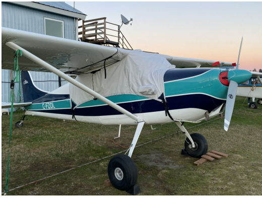
Cessna 170B Over The Top Style Canopy Cover & Engine Plugs