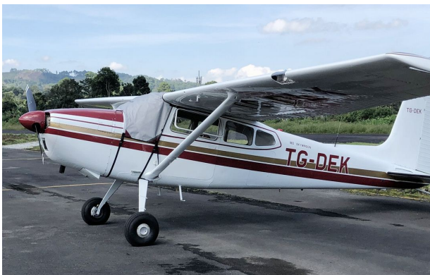
Cessna 180 Windshield Cover

This cover type is made from Silver Acrylic Sunbrella canvas and is 100% lined with a soft and smooth microfiber. Bruce's Custom Covers developed this material combination especially for aircraft protection. The outer material is medium weight and treated for water resistance, UV resistance and anti-static buildup. The inner lining is a very soft and smooth microfiber to prevent scratching. The material is very reflective, and tests show that the cabin interior temperature can be reduced to near-ambient temperature on the hottest of days. It is water, ice and snow repellent, yet breathable to allow moisture to escape from between the cover and the aircraft surface.