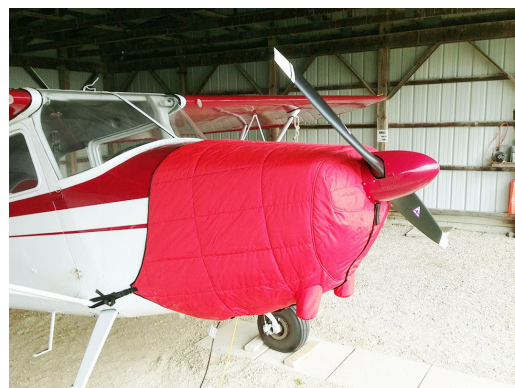
Cessna 170 Insulated Engine Cover