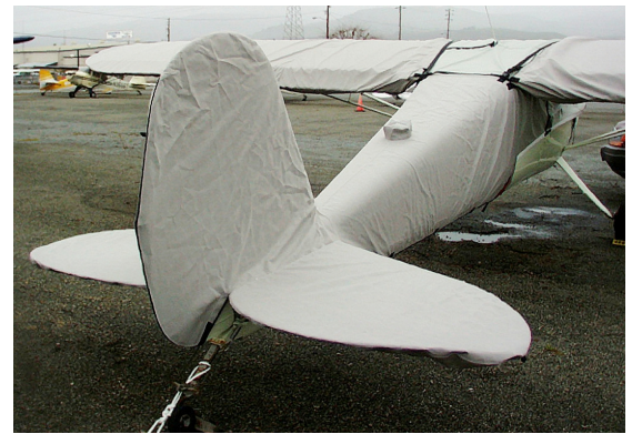
Cessna 120 Empennage Cover