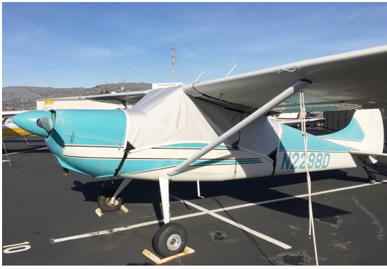
Cessna 170 Over-Top Canopy Cover