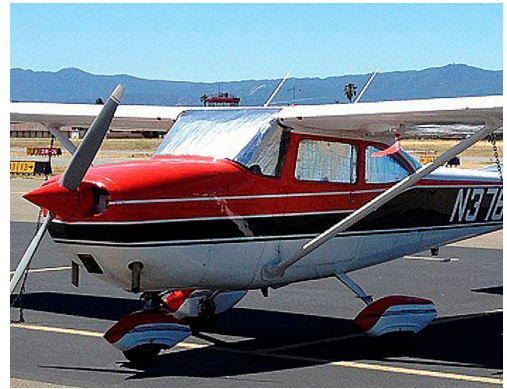
Cessna 172 Cabin HeatShields