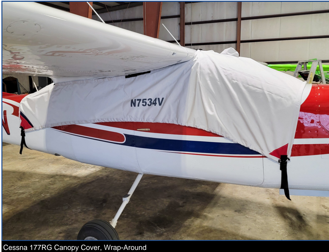
Cessna 177RG Canopy Cover, Wrap-Around