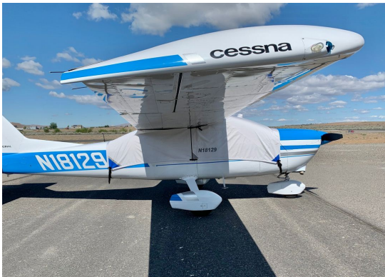
Cessna Cardinal 177 Over-Top Canopy Cover