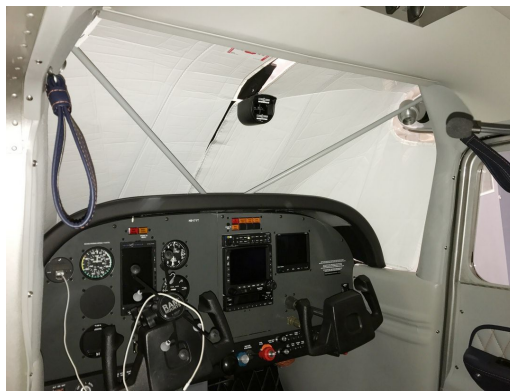
Cessna 180 Skywagon Windshield Heatshield, (W/ Compass)