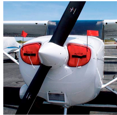
Cessna 172 Engine Plugs