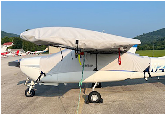
Cessna 177 Cardinal Over-Top Canopy Cover, extends to cover gas caps, & Wing Covers

shorter useful life if used continuously outside than the all-year use material.