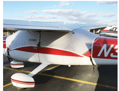
Cessna 177 Cardinal Canopy Cover, Wrap-Around