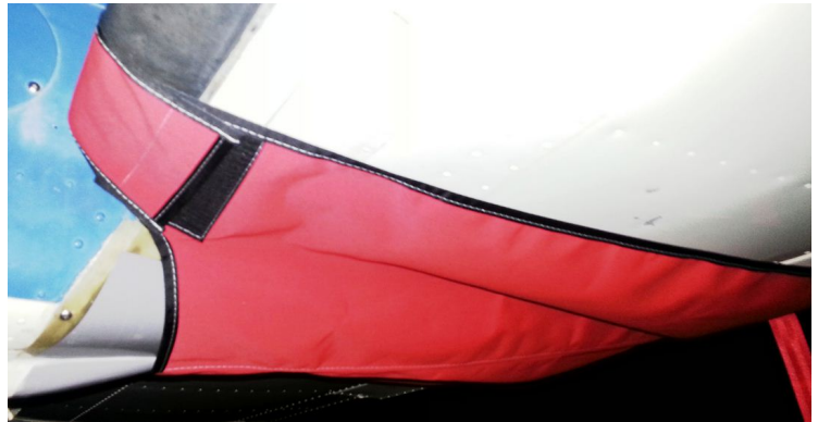
Cessna 177 Cardinal Tailcone Cover (Fully Enclosed)