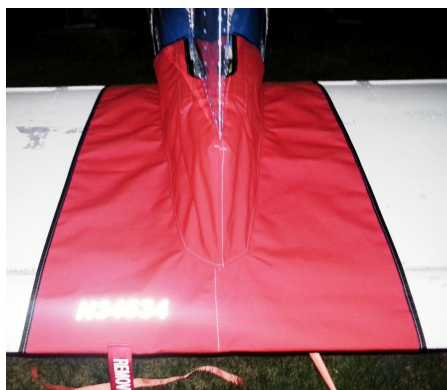
Cessna 177 Cardinal Tailcone Cover (Fully Enclosed)