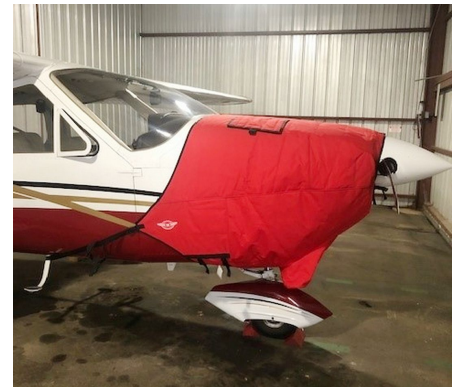
Cessna 177 Cardinal Insulated Engine Cover