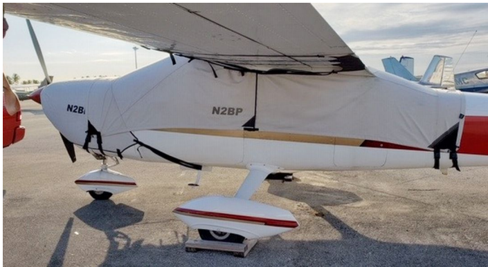
Cessna 177B Cardinal Canopy Cover, Over-Top, Ext. to cover gas caps, 6" fwd extension, & Engine Cover

This cover type is made from Silver Acrylic Sunbrella canvas and is 100% lined with a soft and smooth microfiber. Bruce's Custom Covers developed this material combination especially for aircraft protection. The outer material is medium weight and treated for water resistance, UV resistance and anti-static buildup. The inner lining is a very soft and smooth microfiber to prevent scratching. The material is very reflective, and tests show that the cabin interior temperature can be reduced to near-ambient temperature on the hottest of days. It is water, ice and snow repellent, yet breathable to allow moisture to escape from between the cover and the aircraft surface.