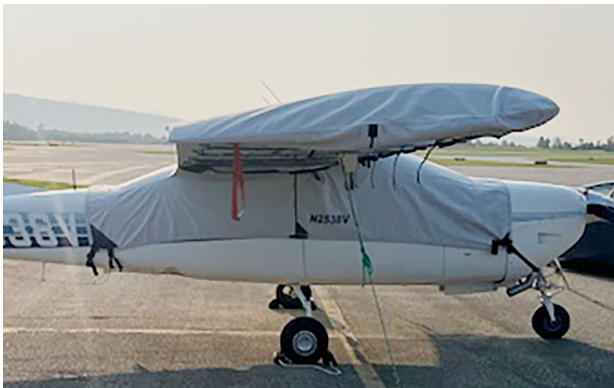
Cessna 177 Cardinal Over-Top Canopy Cover, extends to cover gas caps, & Wing Covers

This cover type is made from Silver Acrylic Sunbrella canvas and is 100% lined with a soft and smooth microfiber. Bruce's Custom Covers developed this material combination especially for aircraft protection. The outer material is medium weight and treated for water resistance, UV resistance and anti-static buildup. The inner lining is a very soft and smooth microfiber to prevent scratching. The material is very reflective, and tests show that the cabin interior temperature can be reduced to near-ambient temperature on the hottest of days. It is water, ice and snow repellent, yet breathable to allow moisture to escape from between the cover and the aircraft surface.