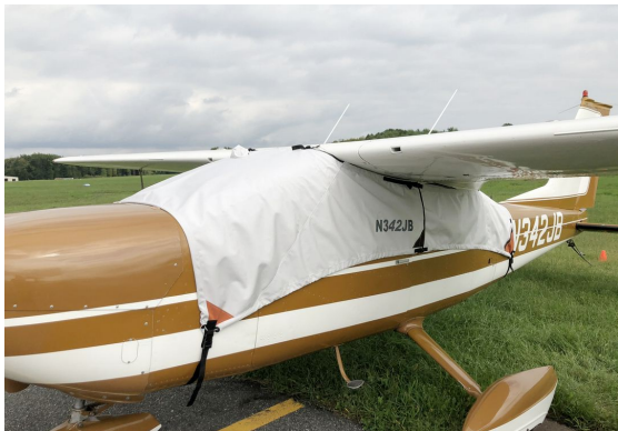
1968 Cessna 177 Wrap Around Canopy Cover

This cover type is made from Silver Acrylic Sunbrella canvas and is 100% lined with a soft and smooth microfiber. Bruce's Custom Covers developed this material combination especially for aircraft protection. The outer material is medium weight and treated for water resistance, UV resistance and anti-static buildup. The inner lining is a very soft and smooth microfiber to prevent scratching. The material is very reflective, and tests show that the cabin interior temperature can be reduced to near-ambient temperature on the hottest of days. It is water, ice and snow repellent, yet breathable to allow moisture to escape from between the cover and the aircraft surface.