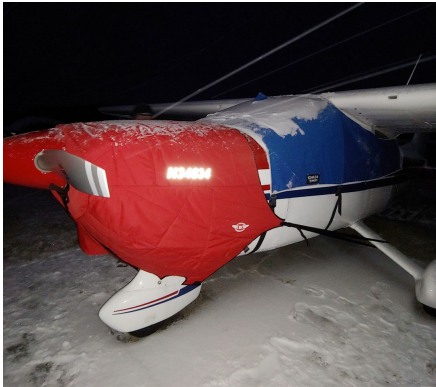
Cessna 177 Cardinal Insulated Engine Covers