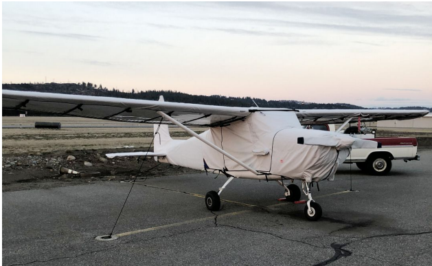
Cessna 172 Wing Cover

This cover type is made from Silver Acrylic Sunbrella canvas and is 100% lined with a soft and smooth microfiber. Bruce's Custom Covers developed this material combination especially for aircraft protection. The outer material is medium weight and treated for water resistance, UV resistance and anti-static buildup. The inner lining is a very soft and smooth microfiber to prevent scratching. The material is very reflective, and tests show that the cabin interior temperature can be reduced to near-ambient temperature on the hottest of days. It is water, ice and snow repellent, yet breathable to allow moisture to escape from between the cover and the aircraft surface.