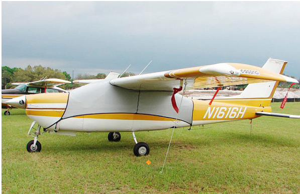
Cessna Cardinal Spandex FlyAway Cover

Travel Covers are made with Silver Solution-Dyed Polyester fabric and only lined over the windshield to save weight. The material is lightweight and more compact for easy stowage in the aircraft. The polyester material is water resistant, but only intended for occasional use outside. We also have an ultra lightweight material available for fitted hangar dust covers. For daily outdoor use, the non-travel Sunbrella Cover is the best choice.