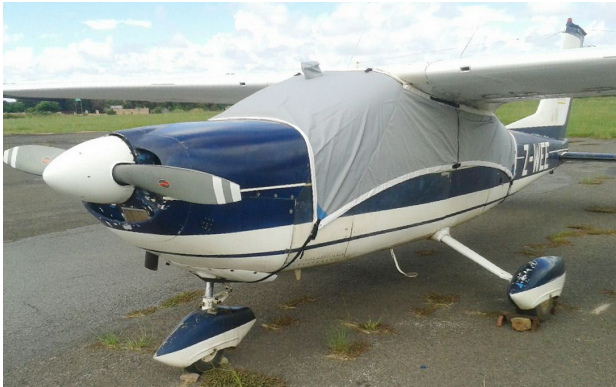
Cessna 177 Cardinal Travel Canopy Cover