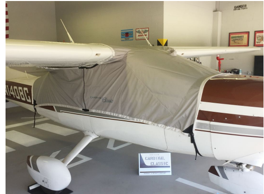
Cessna 177 Cardinal Travel Cover, Light Weight Travel Canopy Cover (Over-The-Top Style), 7 Lbs