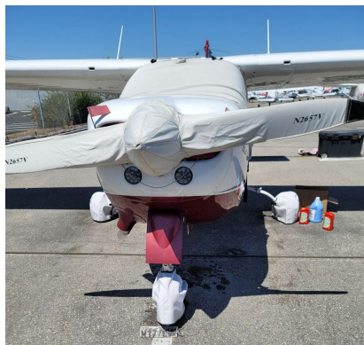
Cessna 177RG Tire & Prop Covers

ALL-YEAR USE MATERIAL - Made with Silver Acrylic Sunbrella canvas, the all-year use material is the best option for sun protection and cover longevity. This heavier more durable material is intended for all weather conditions, such as rain and snow or lots of sun.