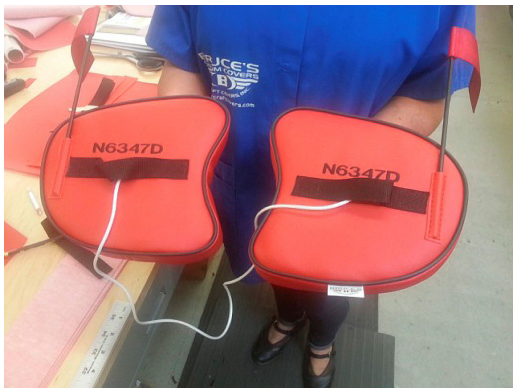
Cessna 172 Standard Engine Plugs

Engine Inlet Plugs are custom fit for your Cessna 177 Cardinal intakes, made with heavy-duty vinyl material, and stuffed with a single block of sculpted urethane foam. Each plug has a zipper that allows the foam to be removed and dried if necessary. Engine plugs have warning flags that are visible from the cockpit or 'remove before flight' streamers sewn onto the face of the plugs. Most plugs are imprinted with the aircraft registration number in black for an extra charge. Storage bag NOT included. Engine plugs may be inserted after flight when the engine is still warm. Engine Inlet Plugs are commonly referred to as Cowl Plugs, Intake Plugs, Cowl Blocks, Engine Blocks, and Engine Bungs.