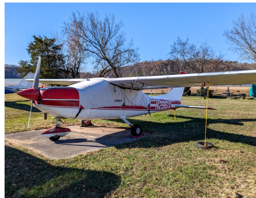
Cessna 177 Cardinal Engine Inlet Plugs, Fixed Gear Models (1968-72)