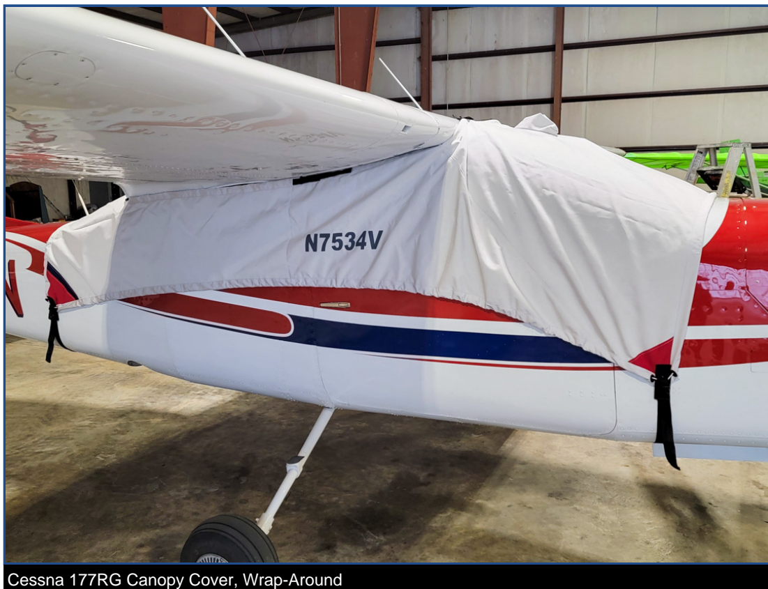
Cessna 177RG Canopy Cover, Wrap-Around