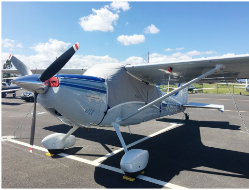
Cessna 180 Travel Weight Canopy Cover, Engine Plugs