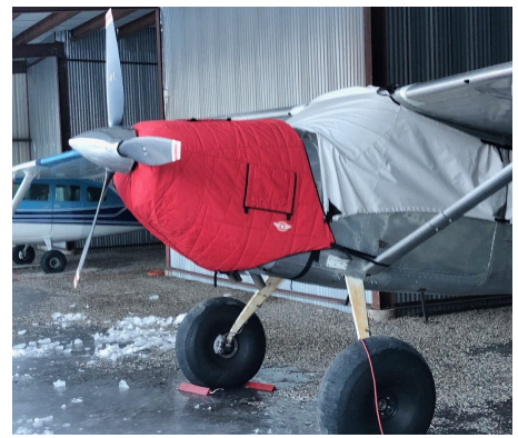
Cessna 185 Insulated Engine Cover