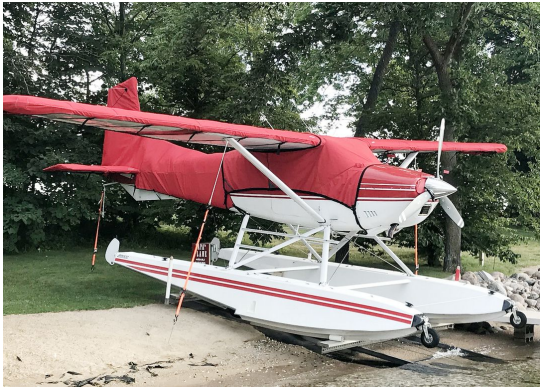
Cessna 185 Canopy, Wings & Empennage Covers, and Engine Plugs