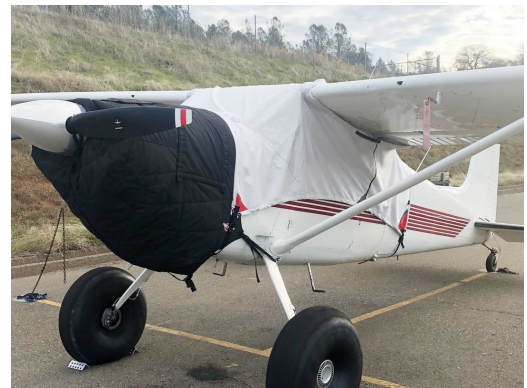
Insulated Engine Cover, Canopy Cover