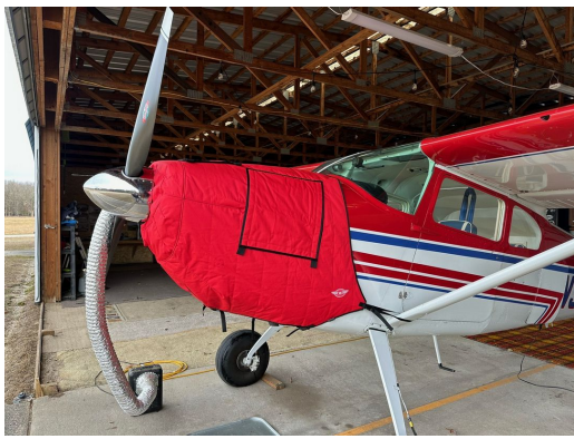
Cessna 180 Insulated Engine Cover, Does Not Cover Bottom