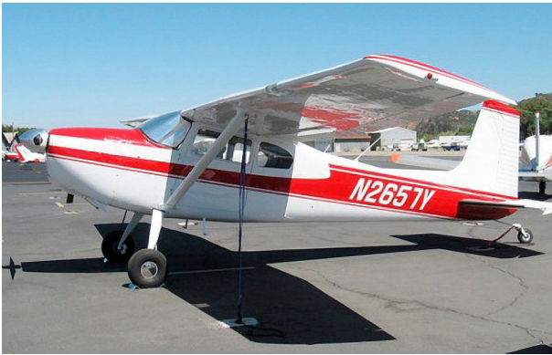
Cessna 180 & 185 Windshield HeatShield

Windshield Heatshields are interior sunshades for an aircraft's front windshield. The product is a unique composite of closed-cell foam with a silver mylar finish. The semi-rigid design is stiff enough to stand along the inside of the windshield using sun visors or window framing. It folds up flat and easily stores in the included storage sleeve. Some designs may require velcro and suction cups or split right and left sides. A Heatshield is an excellent short-term remedy for cockpit overheating. An external fabric cover is far more effective and practical for long-term protection.