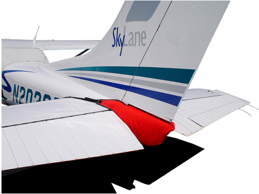
Cessna 182 Tailcone Cover