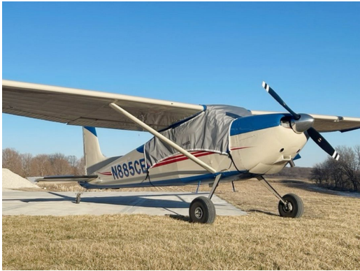
Cessna 180 Travel Weight Canopy Cover

The material is very reflective, and tests show that the cabin interior temperature can be reduced to near-ambient temperature on the hottest of days. It is water, ice and snow repellent, yet breathable to allow moisture to escape from between the cover and the aircraft surface.