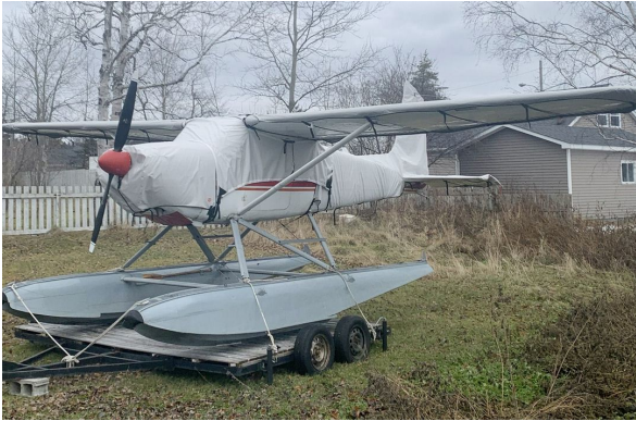
Cessna 180A Canopy, Engine, Wing & Empennage Covers

WINTER USE MATERIAL - Made with Solution-Dyed Polyester fabric, this option is intended for seasonal use to aid in deicing, rain mitigation, or for occasional travel. The material is lighter and more compact, but more susceptible to UV damage and may have a shorter useful life if used continuously outside than the all-year use material.