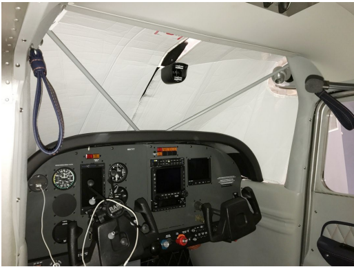
Cessna 180 Skywagon Windshield Heatshield, (W/ Compass)