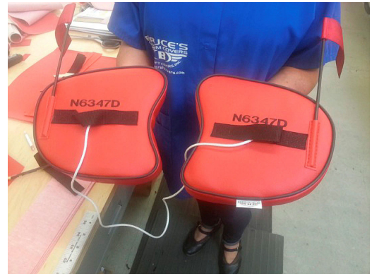
Cessna 172 Standard Engine Plugs