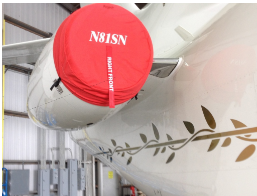
Falcon 900EX Intake Cover

The Falcon Jet 2000 Intake Covers are designed to install easily yet be completely storable. A spring steel hoop is sewn into the hem of each cover, allowing them to be installed without climbing onto the wing or using a stepladder. To store the covers the spring steel hoop folds like a band-saw blade into three nesting rings. Each cover folds into a compact circular bundle which is stored in the included duffle bag, yet they unfold quickly for use. The Tri-Fold Ring cover is made of medium weight nylon which is available in a variety of colors to match the paint trim. Each cover set comes complete with installation and folding instructions. The aircraft's registration number can be silkscreened onto the cover for an extra charge.