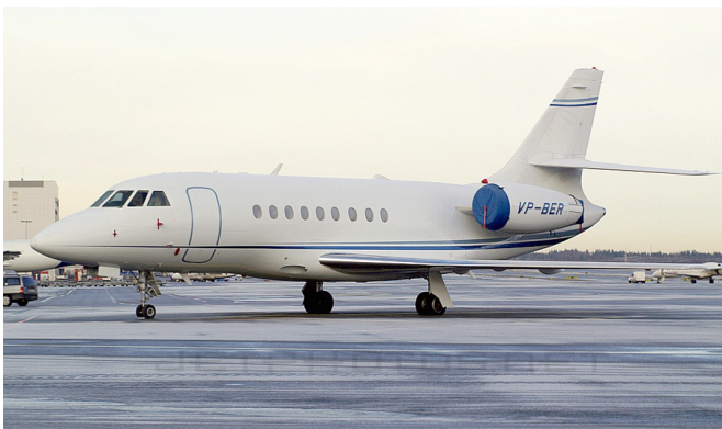
Falcon 2000 Engine Cover Set

The Falcon Jet 2000 Intake Covers are designed to install easily yet be completely storable. A spring steel hoop is sewn into the hem of each cover, allowing them to be installed without climbing onto the wing or using a stepladder. To store the covers the spring steel hoop folds like a band-saw blade into three nesting rings. Each cover folds into a compact circular bundle which is stored in the included duffle bag, yet they unfold quickly for use. The Tri-Fold Ring cover is made of medium weight nylon which is available in a variety of colors to match the paint trim. Each cover set comes complete with installation and folding instructions. The aircraft's registration number can be silkscreened onto the cover for an extra charge.