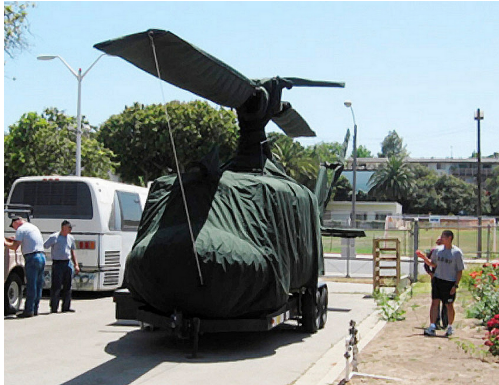
Bell 204/205 Full Body Cover Set

This cover type is made from Silver Acrylic Sunbrella canvas and is 100% lined with a soft and smooth microfiber. Bruce's Custom Covers developed this material combination especially for aircraft protection. The outer material is medium weight and treated for water resistance, UV resistance and anti-static buildup. The inner lining is a very soft and smooth microfiber to prevent scratching. The material is very reflective, and tests show that the cabin interior temperature can be reduced to near-ambient temperature on the hottest of days. It is water, ice and snow repellent, yet breathable to allow moisture to escape from between the cover and the aircraft surface.