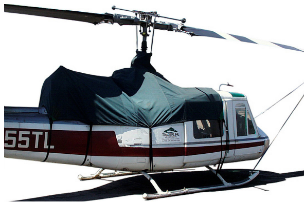
Bell 204/205 Engine/Mid-Cabin Cover

WINTER USE MATERIAL - Made with Solution-Dyed Polyester fabric, this option is intended for seasonal use to aid in deicing, rain mitigation, or for occasional travel. The material is lighter and more compact, but more susceptible to UV damage and may have a shorter useful life if used continuously outside than the all-year use material.