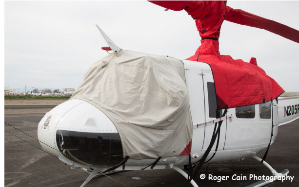
Bell 205 Engine, Rotor Mast, Blades & Forward Cabin Covers