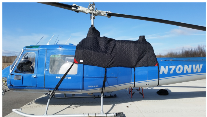
Bell 204 Insulated Engine Area Cover