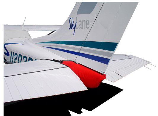
Cessna 182 Tailcone Cover