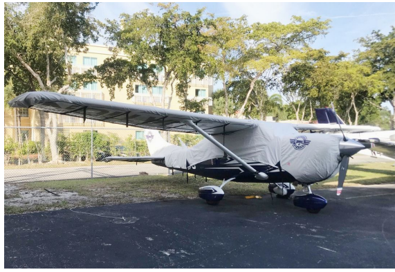
Cessna T206H Canopy, Engine, Wing & Empennage Covers