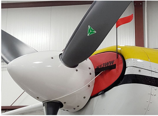
Cessna 180/185 Skywagon Engine Inlet Plugs

be inserted after flight when the engine is still warm. Engine Inlet Plugs are commonly referred to as Cowl Plugs, Intake Plugs, Cowl Blocks, Engine Blocks, and Engine Bungs.