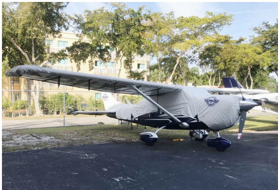
Cessna T206H Canopy, Engine, Wing & Empennage Covers

WINTER USE MATERIAL - Made with Solution-Dyed Polyester fabric, this option is intended for seasonal use to aid in deicing, rain mitigation, or for occasional travel. The material is lighter and more compact, but more susceptible to UV damage and may have a shorter useful life if used continuously outside than the all-year use material.