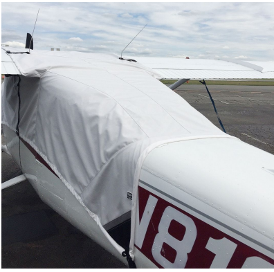
Cessna 205 Over-Top Canopy Cover