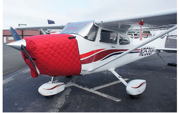
Cessna 172 Insulated Engine Cover, fully enclosed