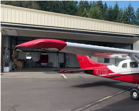
Cessna 206 Wingtip Pads

Designed to prevent damage to the aircraft extremities in crowded hangars, these products are made of bright red Naugahyde and thickly padded with a sandwich of closed cell foam.