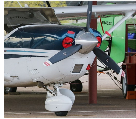
Cessna T206H Engine Inlet Plugs