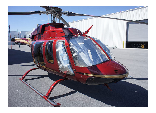
Bell 407 Cockpit HeatShield set, hi-vis window mod

Heatshields are interior sunshades for an aircraft's windows or canopy glass. The product is a unique composite of closed-cell foam with a silver mylar finish. The semi-rigid design is stiff enough to stand along the inside of the windshield using sun visors or window framing. It folds up flat and easily stores in the included storage sleeve. Some designs may require velcro and suction cups. A Heatshield is an excellent short-term remedy for cockpit overheating.