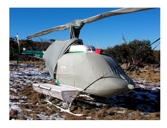
JetRanger Bubble, Engine, Rotor Hub & Blade Covers (& Tie-Downs)