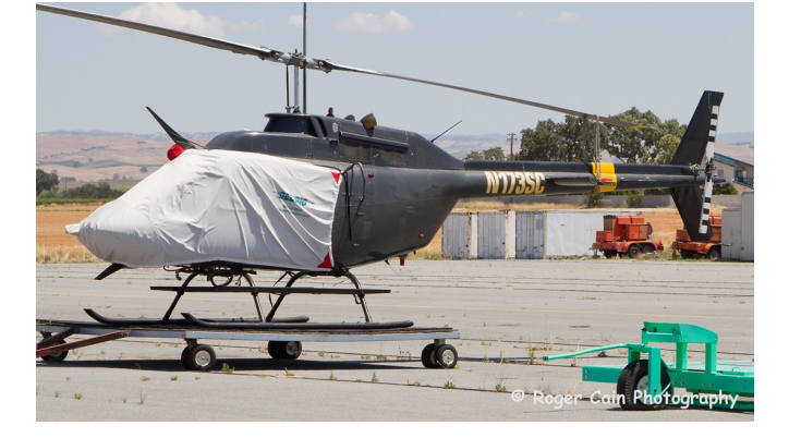
Bell JetRanger Bubble Cover