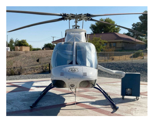
Bell 407 Windshield HeatShields