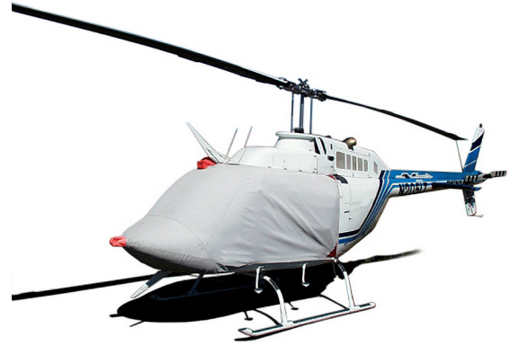
JetRanger Bubble Cover