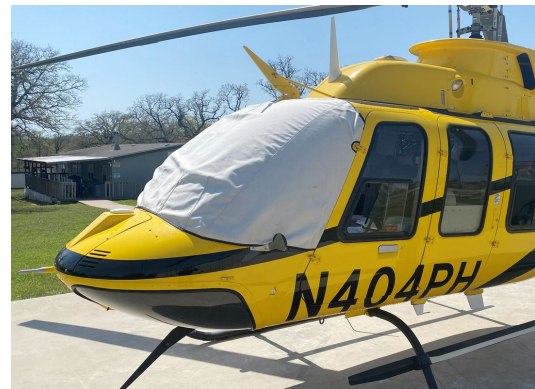
Bell 407 Windshield Cover