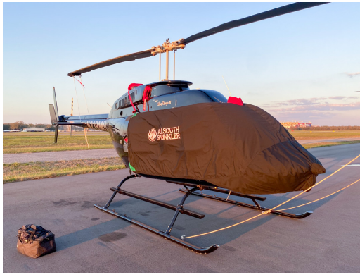
Bell 206L Longranger Intake Plugs