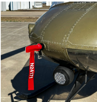
Bell 206B Jetranger Pitot Cover+

WINTER USE MATERIAL - Made with Solution-Dyed Polyester fabric, this option is intended for seasonal use to aid in deicing, rain mitigation, or for occasional travel. The material is lighter and more compact, but more susceptible to UV damage and may have a shorter useful life if used continuously outside than the all-year use material.