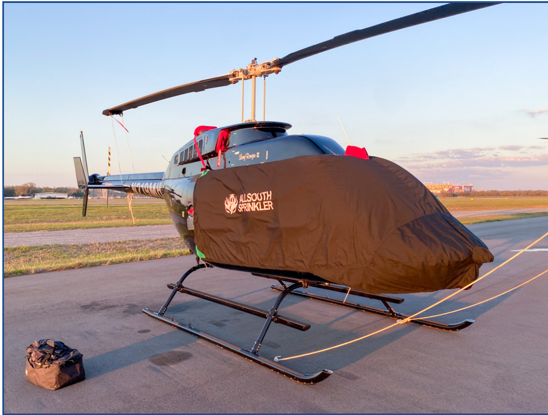
Bell 206L Longranger Bubble Cover, Custom black Sunbrella