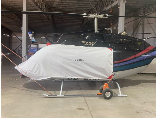
Bell 206L Longranger Bubble Cover With Wire Strike

This cover type is made from Silver Acrylic Sunbrella canvas and is 100% lined with a soft and smooth microfiber. Bruce's Custom Covers developed this material combination especially for aircraft protection. The outer material is medium weight and treated for water resistance, UV resistance and anti-static buildup. The inner lining is a very soft and smooth microfiber to prevent scratching. The material is very reflective, and tests show that the cabin interior temperature can be reduced to near-ambient temperature on the hottest of days. It is water, ice and snow repellent, yet breathable to allow moisture to escape from between the cover and the aircraft surface.