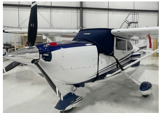
Cessna 182 Windshield Cover, Engine Plugs