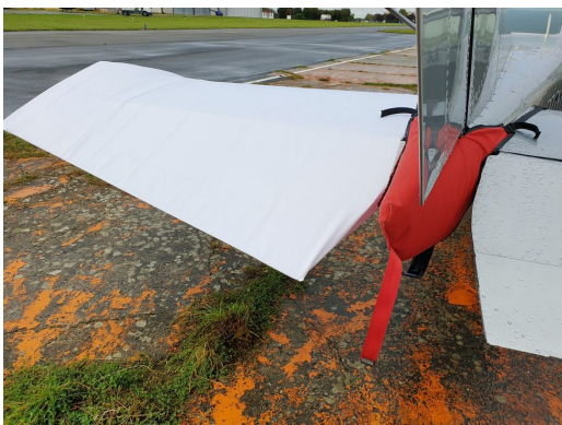
Cessna 207 Tailcone Cover, Horizontal Stab. Cover (test fit)

WINTER USE MATERIAL - Made with Solution-Dyed Polyester fabric, this option is intended for seasonal use to aid in deicing, rain mitigation, or for occasional travel. The material is lighter and more compact, but more susceptible to UV damage and may have a shorter useful life if used continuously outside than the all-year use material.