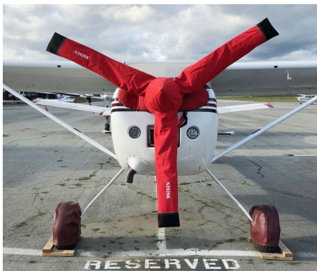
Cessna Skywagon Propellor/Spinner Cover, 3-blade type

This cover type is made from Silver Acrylic Sunbrella canvas and is 100% lined with a soft and smooth microfiber. Bruce's Custom Covers developed this material combination especially for aircraft protection. The outer material is medium weight and treated for water resistance, UV resistance and anti-static buildup. The inner lining is a very soft and smooth microfiber to prevent scratching. The material is very reflective, and tests show that the cabin interior temperature can be reduced to near-ambient temperature on the hottest of days. It is water, ice and snow repellent, yet breathable to allow moisture to escape from between the cover and the aircraft surface.