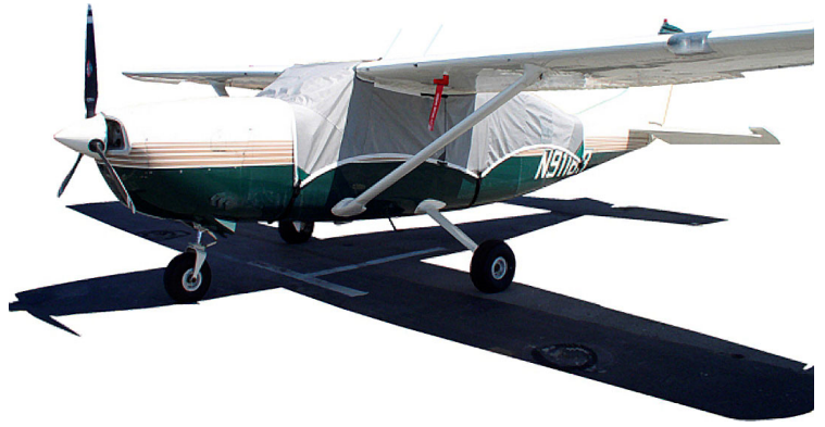
Cessna 207 Canopy Cover