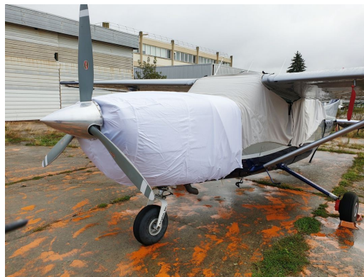
Cessna 207 Engine Cover (test fit)