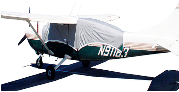
Cessna 207 Canopy Cover