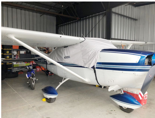
Cessna 206 Wrap-Around Canopy Cover

This cover type is made from Silver Acrylic Sunbrella canvas and is 100% lined with a soft and smooth microfiber. Bruce's Custom Covers developed this material combination especially for aircraft protection. The outer material is medium weight and treated for water resistance, UV resistance and anti-static buildup. The inner lining is a very soft and smooth microfiber to prevent scratching. The material is very reflective, and tests show that the cabin interior temperature can be reduced to near-ambient temperature on the hottest of days. It is water, ice and snow repellent, yet breathable to allow moisture to escape from between the cover and the aircraft surface.