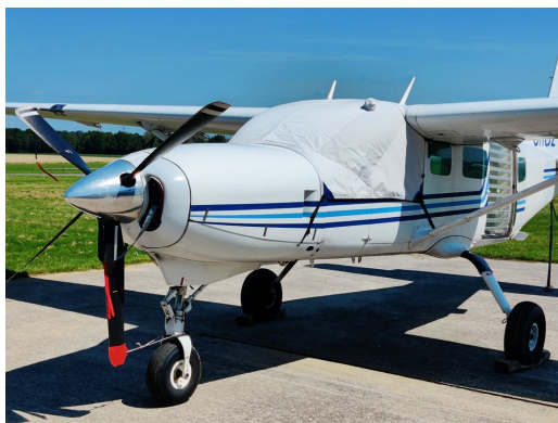
Cessna Caravan 208A Cockpit Cover

This cover type is made from Silver Acrylic Sunbrella canvas and is 100% lined with a soft and smooth microfiber. Bruce's Custom Covers developed this material combination especially for aircraft protection. The outer material is medium weight and treated for water resistance, UV resistance and anti-static buildup. The inner lining is a very soft and smooth microfiber to prevent scratching. The material is very reflective, and tests show that the cabin interior temperature can be reduced to near-ambient temperature on the hottest of days. It is water, ice and snow repellent, yet breathable to allow moisture to escape from between the cover and the aircraft surface.