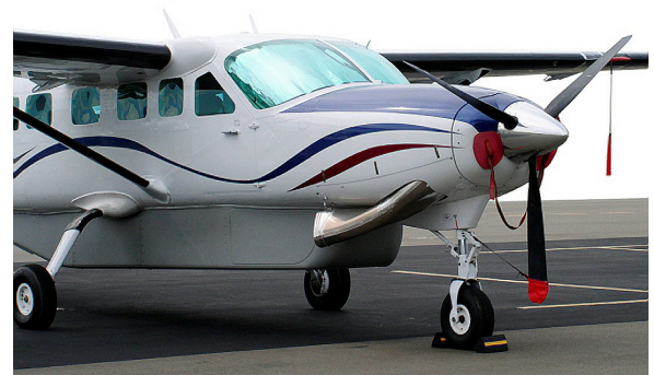
Cessna 208 Caravan, U-27A, AC-208 Heatshield Set (208A Models)