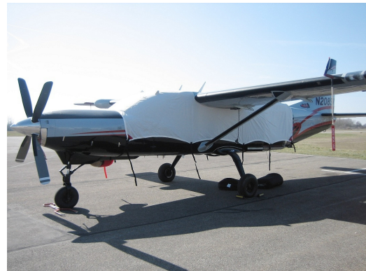
Cessna Caravan Canopy Cover