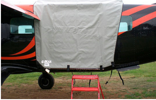
Cessna 208 Caravan Jump Door Cover

ALL-YEAR USE MATERIAL - Made with Silver Acrylic Sunbrella canvas, the all-year use material is the best option for sun protection and cover longevity. This heavier more durable material is intended for all weather conditions, such as rain and snow or lots of sun.