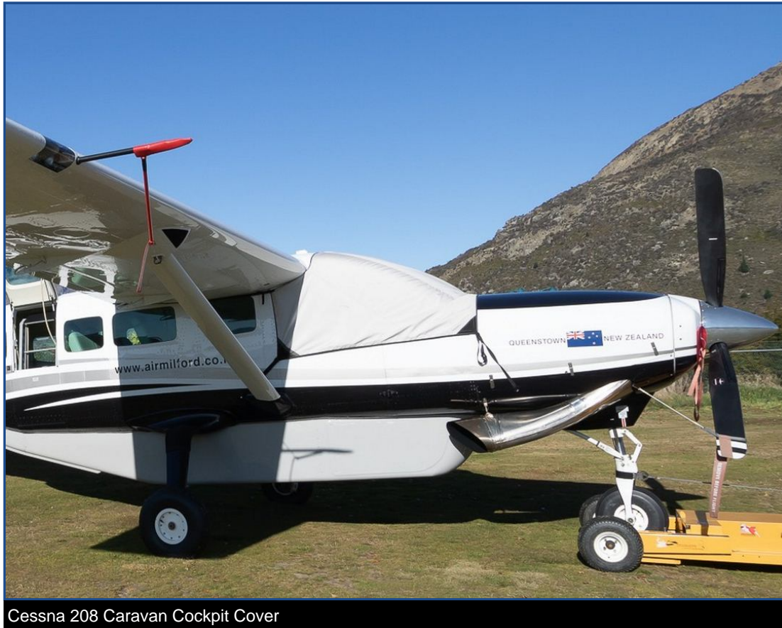
Cessna 208 Caravan Cockpit Cover