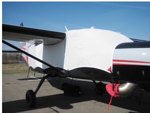
Cessna Caravan Canopy Cover