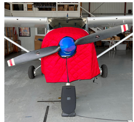
Insulated Hangar Blanket on Cessna 182