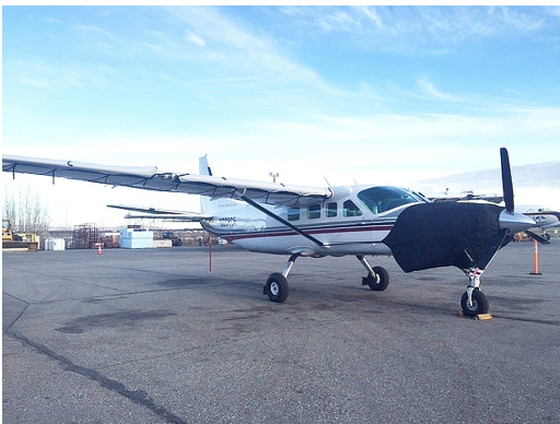
Cessna 208 Caravan Insulated Engine Cover & Wing Covers

WINTER USE MATERIAL - Made with Solution-Dyed Polyester fabric, this option is intended for seasonal use to aid in deicing, rain mitigation, or for occasional travel. The material is lighter and more compact, but more susceptible to UV damage and may have a shorter useful life if used continuously outside than the all-year use material.