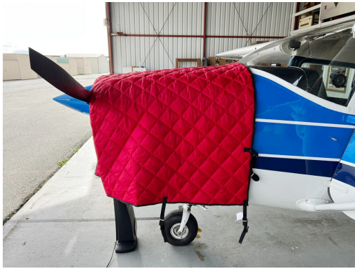
Insulated Hangar Blanket on Cessna 182