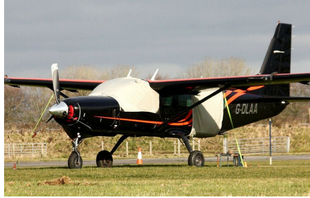
Cessna Caravan Cockpit Cover, Engine Plugs, Jump Door Cover