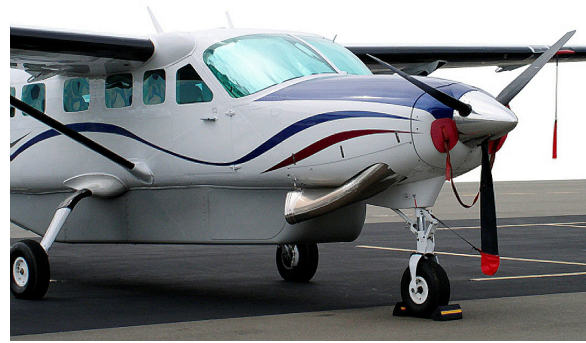
Cessna Caravan Windshield HeatShield, Plugs, Prop Ties & Pitot Cover