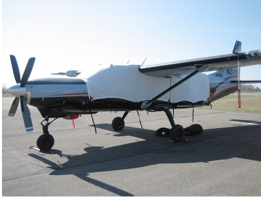
Cessna Caravan Canopy Cover

The material is very reflective, and tests show that the cabin interior temperature can be reduced to near-ambient temperature on the hottest of days. It is water, ice and snow repellent, yet breathable to allow moisture to escape from between the cover and the aircraft surface.