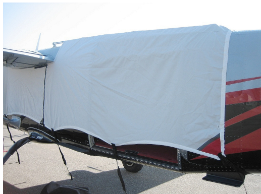
Cessna Caravan Canopy Cover

This cover type is made from Silver Acrylic Sunbrella canvas and is 100% lined with a soft and smooth microfiber. Bruce's Custom Covers developed this material combination especially for aircraft protection. The outer material is medium weight and treated for water resistance, UV resistance and anti-static buildup. The inner lining is a very soft and smooth microfiber to prevent scratching. The material is very reflective, and tests show that the cabin interior temperature can be reduced to near-ambient temperature on the hottest of days. It is water, ice and snow repellent, yet breathable to allow moisture to escape from between the cover and the aircraft surface.