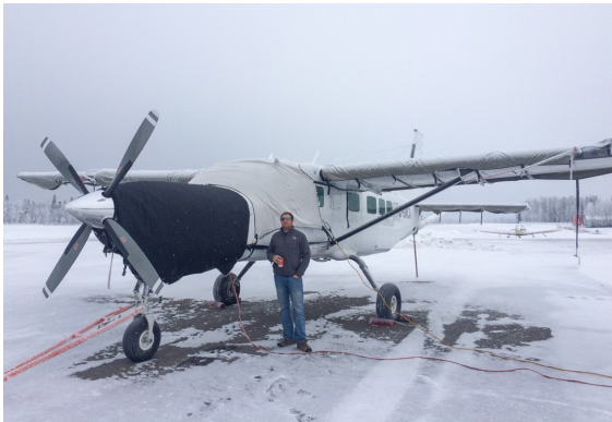
Cessna 208 Caravan Insulated Engine, Cockpit & Wing Covers

WINTER USE MATERIAL - Made with Solution-Dyed Polyester fabric, this option is intended for seasonal use to aid in deicing, rain mitigation, or for occasional travel. The material is lighter and more compact, but more susceptible to UV damage and may have a shorter useful life if used continuously outside than the all-year use material.