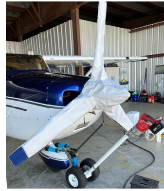
Cessna 182 Skylane 3-Blade Prop Cover