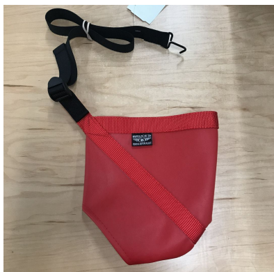
Prop Tie-Down, Various Models (secures with a hook to engine nacelle)

This cover type is made from Silver Acrylic Sunbrella canvas and is 100% lined with a soft and smooth microfiber. Bruce's Custom Covers developed this material combination especially for aircraft protection. The outer material is medium weight and treated for water resistance, UV resistance and anti-static buildup. The inner lining is a very soft and smooth microfiber to prevent scratching. The material is very reflective, and tests show that the cabin interior temperature can be reduced to near-ambient temperature on the hottest of days. It is water, ice and snow repellent, yet breathable to allow moisture to escape from between the cover and the aircraft surface.