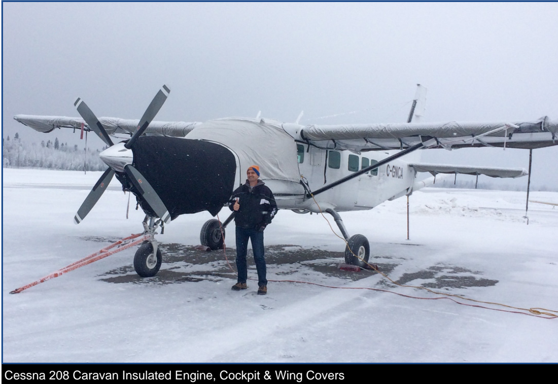
Cessna 208 Caravan Insulated Engine, Cockpit &amp; Wing Covers