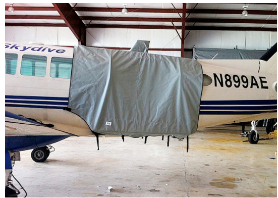
750XL Jump Door Cover