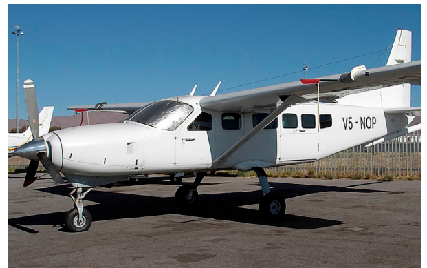
Cessna 208 Caravan Windshield HeatShield