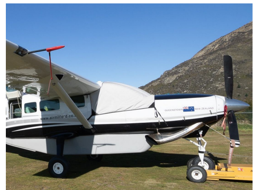
Cessna 208 Caravan Cockpit Cover