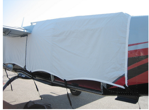
Cessna Caravan Canopy Cover