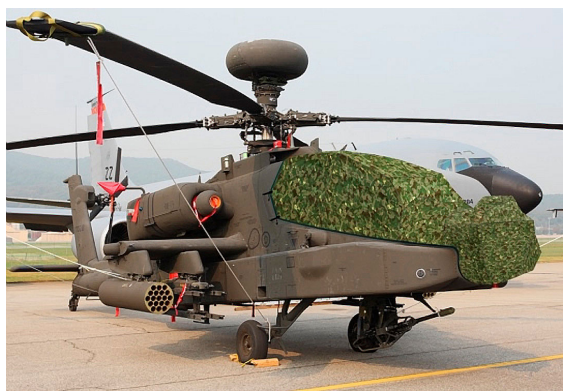
Canopy/Nose Cover, covers canopy glass and TADS

Canopy/Nose Covers enclose the entire canopy including the windshield, skylights, and chin bubble. Attachment buckles are made of nonmetal Delrin , designed for rugged outdoor use. Both the top and bottom hems of the cover have a special rope-hem feature with which they can be tightened to help prevent abrasive chafing of the windshield. Pockets are sewn into the cover for the temperature probe and pitot tubes. The bubble cover is reinforced with patches at hinge points, door handles, and for the windshield wipers. For ease of installation, the bubble cover is color-coded (red=left, green=right) with color swatches sewn into the corners. This cover type is made from Silver Acrylic Sunbrella canvas and is 100% lined with a soft and smooth microfiber. Bruce's Custom Covers developed this material combination especially for aircraft protection. The outer material is medium weight and treated for water resistance, UV resistance and anti-static buildup. The inner lining is a very soft and smooth microfiber to prevent scratching. The material is very reflective, and tests show that the cabin interior temperature can be reduced to near-ambient temperature on the hottest of days. It is water, ice and snow repellent, yet breathable to allow moisture to escape from between the cover and the aircraft surface.