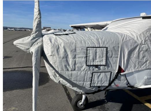
Cessna 210 Winter Cover Set