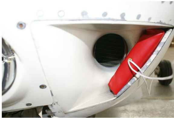
Cessna 210 Engine Inlet Plug