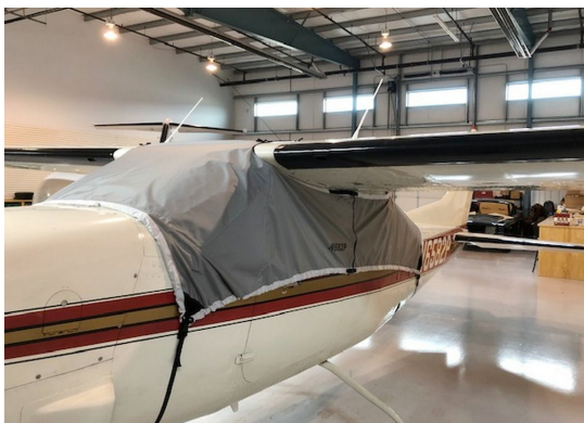
Cessna P210N Wrap Around Travel Cover

Travel Covers are made with Silver Solution-Dyed Polyester fabric and only lined over the windshield to save weight. The material is lightweight and more compact for easy stowage in the aircraft. The polyester material is water resistant, but only intended for occasional use outside. We also have an ultra lightweight material available for fitted hangar dust covers. For daily outdoor use, the non-travel Sunbrella Cover is the best choice.