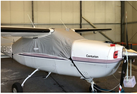
Cessna 210 Travel Weight Canopy Cover