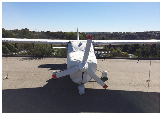
Cessna 210 Full Cover Set

WINTER USE MATERIAL - Made with Solution-Dyed Polyester fabric, this option is intended for seasonal use to aid in deicing, rain mitigation, or for occasional travel. The material is lighter and more compact, but more susceptible to UV damage and may have a shorter useful life if used continuously outside than the all-year use material.