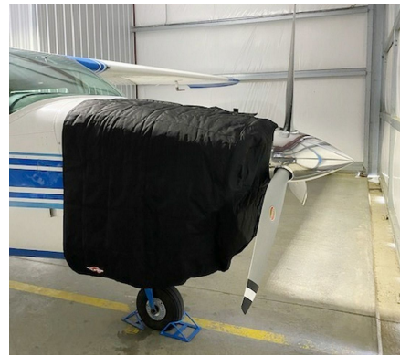
Cessna T210L Insulated Engine Cover