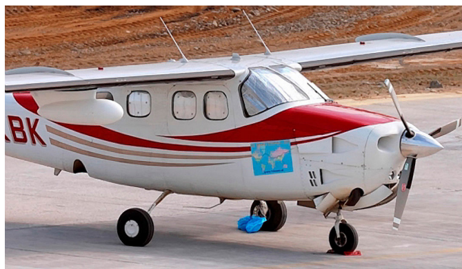
Cessna P210 HeatShield Set