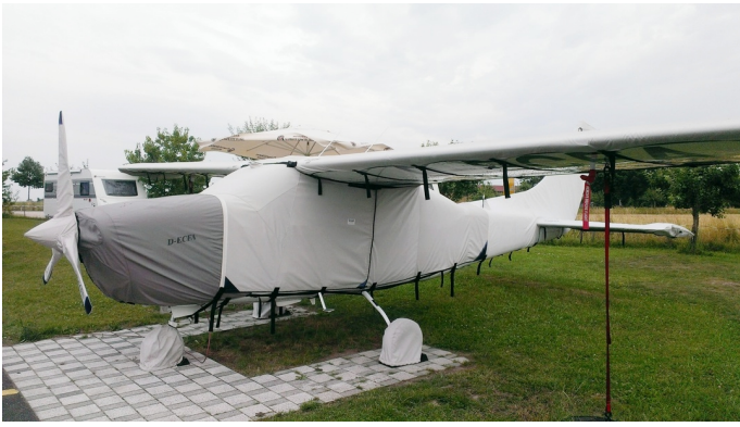
Cessna 210 Complete Cover Set