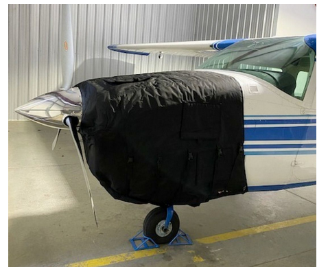
Cessna T210L Insulated Engine Cover