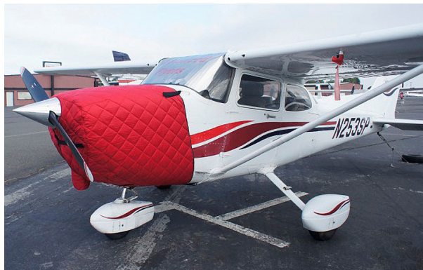
Cessna 172 Insulated Engine Cover, fully enclosed

Windshield Heatshields are interior sunshades for an aircraft's front windshield. The product is a unique composite of closed-cell foam with a silver mylar finish. The semi-rigid design is stiff enough to stand along the inside of the windshield using sun visors or window framing. It folds up flat and easily stores in the included storage sleeve. Some designs may require velcro and suction cups or split right and left sides. A Heatshield is an excellent short-term remedy for cockpit overheating. An external fabric cover is far more effective and practical for long-term protection.