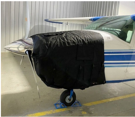
Cessna T210L Insulated Engine Cover

This cover type is made from Silver Acrylic Sunbrella canvas and is 100% lined with a soft and smooth microfiber. Bruce's Custom Covers developed this material combination especially for aircraft protection. The outer material is medium weight and treated for water resistance, UV resistance and anti-static buildup. The inner lining is a very soft and smooth microfiber to prevent scratching. The material is very reflective, and tests show that the cabin interior temperature can be reduced to near-ambient temperature on the hottest of days. It is water, ice and snow repellent, yet breathable to allow moisture to escape from between the cover and the aircraft surface.