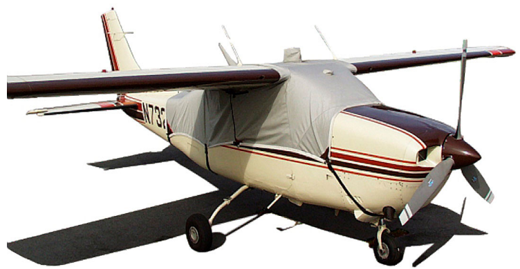
Cessna 210 Over-Top Canopy Cover