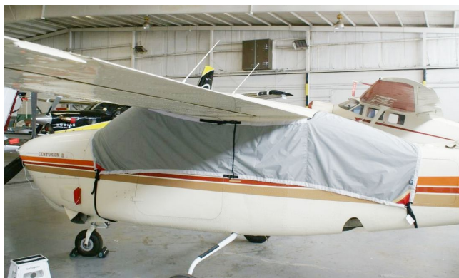
Cessna 210 Travel Cover, Lightweight Canopy Cover

Travel Covers are made with Silver Solution-Dyed Polyester fabric and only lined over the windshield to save weight. The material is lightweight and more compact for easy stowage in the aircraft. The polyester material is water resistant, but only intended for occasional use outside. We also have an ultra lightweight material available for fitted hangar dust covers. For daily outdoor use, the non-travel Sunbrella Cover is the best choice.