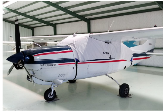
Cessna 210 Centurion Canopy Cover, Wrap-Around, (No Wing Struts: 1967 G-Model & Up)