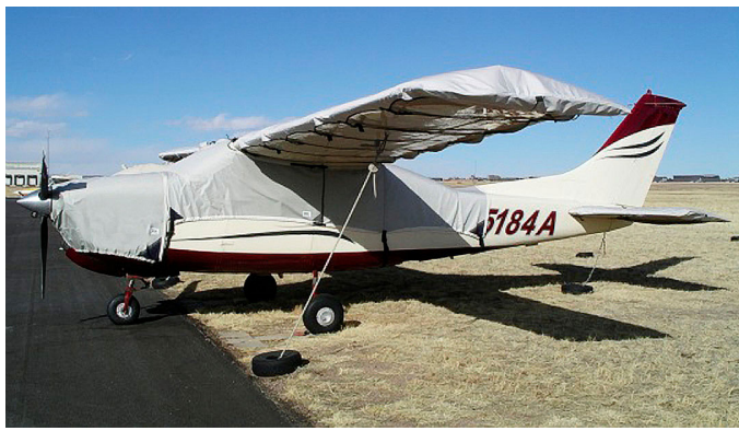
Cessna 210 Engine, Canopy Cover w/ Baggage Door ext. & Wing Covers