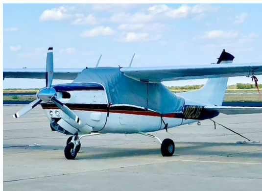
Cessna 210 Canopy Cover, Extends to Cover Baggage Door