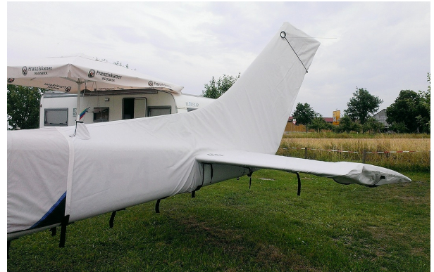
Cessna 210 Empennage Cover