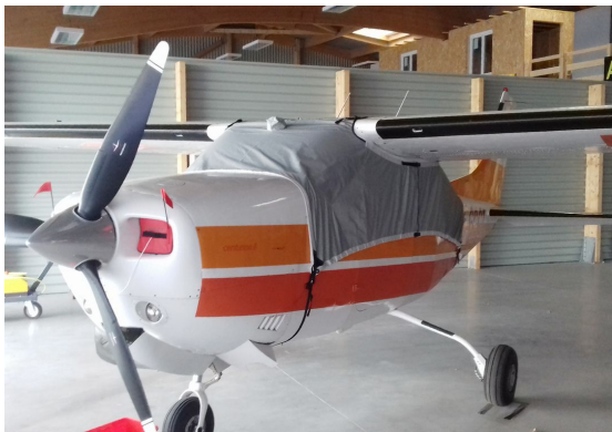
Cessna 210N Engine Inlet Plugs

Travel Covers are made with Silver Solution-Dyed Polyester fabric and only lined over the windshield to save weight. The material is lightweight and more compact for easy stowage in the aircraft. The polyester material is water resistant, but only intended for occasional use outside. We also have an ultra lightweight material available for fitted hangar dust covers. For daily outdoor use, the non-travel Sunbrella Cover is the best choice.