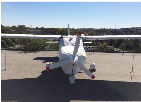
Cessna 210 Full Cover Set

This cover type is made from Silver Acrylic Sunbrella canvas and is 100% lined with a soft and smooth microfiber. Bruce's Custom Covers developed this material combination especially for aircraft protection. The outer material is medium weight and treated for water resistance, UV resistance and anti-static buildup. The inner lining is a very soft and smooth microfiber to prevent scratching. The material is very reflective, and tests show that the cabin interior temperature can be reduced to near-ambient temperature on the hottest of days. It is water, ice and snow repellent, yet breathable to allow moisture to escape from between the cover and the aircraft surface.