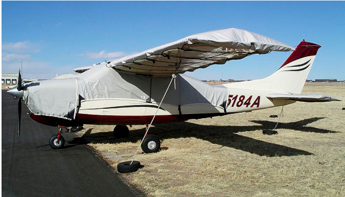
Cessna 210 Engine, Canopy Cover w/ Baggage Door ext. & Wing Covers

WINTER USE MATERIAL - Made with Solution-Dyed Polyester fabric, this option is intended for seasonal use to aid in deicing, rain mitigation, or for occasional travel. The material is lighter and more compact, but more susceptible to UV damage and may have a shorter useful life if used continuously outside than the all-year use material.