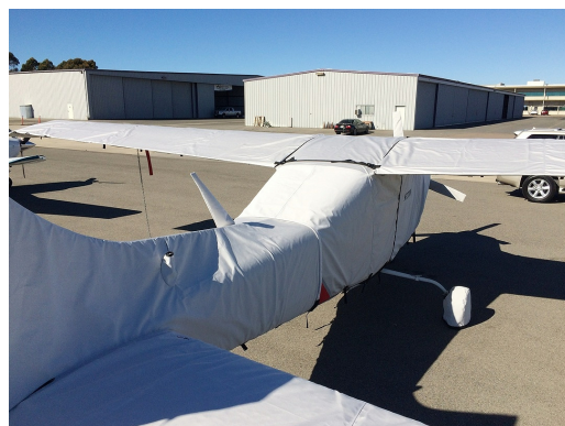
Cessna 210 Full Cover Set