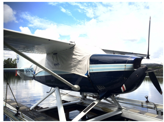
Cessna 206 Wrap-Around Canopy Cover