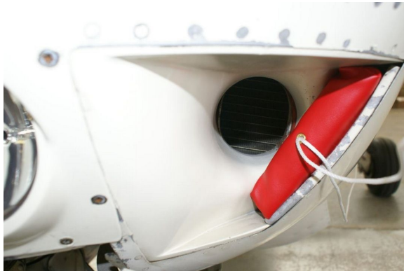
Cessna 210 Engine Inlet Plug

Engine Inlet Plugs are custom fit for your Cessna 210 Centurion intakes, made with heavy-duty vinyl material, and stuffed with a single block of sculpted urethane foam. Each plug has a zipper that allows the foam to be removed and dried if necessary. Engine plugs have warning flags that are visible from the cockpit or 'remove before flight' streamers sewn onto the face of the plugs. Most plugs are imprinted with the aircraft registration number in black for an extra charge. Storage bag NOT included. Engine plugs may be inserted after flight when the engine is still warm. Engine Inlet Plugs are commonly referred to as Cowl Plugs, Intake Plugs, Cowl Blocks, Engine Blocks, and Engine Bungs.