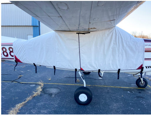
Cessna 210N Extended Canopy Cover, over-top type, extends to cover baggage door