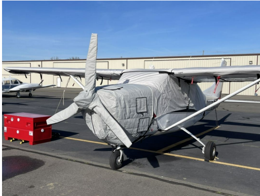
Cessna 210 Winter Cover Set

WINTER USE MATERIAL - Made with Solution-Dyed Polyester fabric, this option is intended for seasonal use to aid in deicing, rain mitigation, or for occasional travel. The material is lighter and more compact, but more susceptible to UV damage and may have a shorter useful life if used continuously outside than the all-year use material.