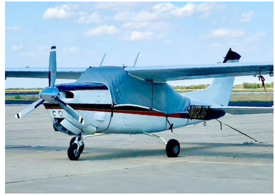
Cessna 210 Canopy Cover, Extends to Cover Baggage Door