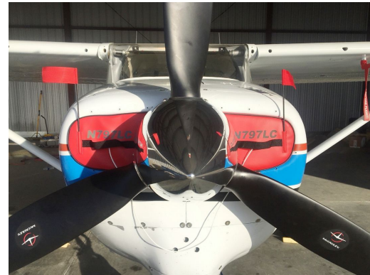
Cessna 210 Inlet Plugs, early model