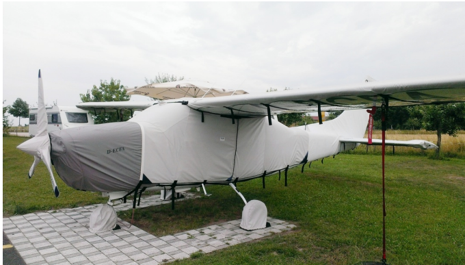
Cessna 210 Complete Cover Set

WINTER USE MATERIAL - Made with Solution-Dyed Polyester fabric, this option is intended for seasonal use to aid in deicing, rain mitigation, or for occasional travel. The material is lighter and more compact, but more susceptible to UV damage and may have a shorter useful life if used continuously outside than the all-year use material.