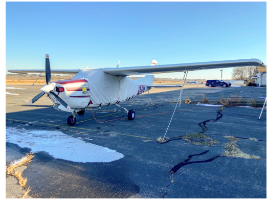
Cessna 210N Extended Canopy Cover, over-top type, extends to cover baggage door