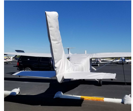
Cessna 210B Empennage Cover