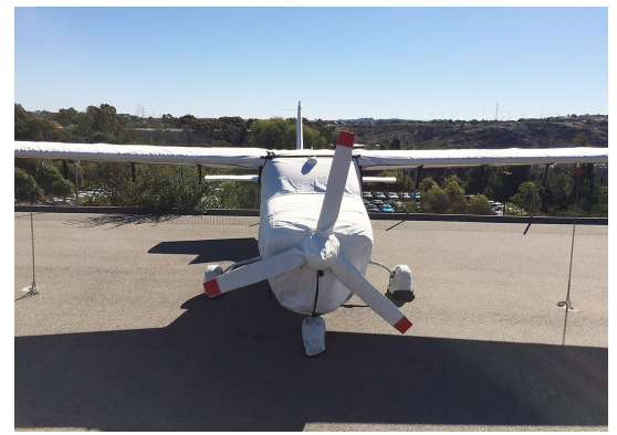
Cessna 210 Full Cover Set