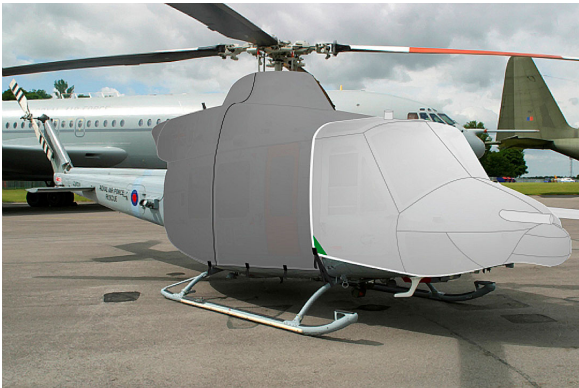
Forward Cabin Nose & Mid-Cabin/Engine Cover (extended to cross tubes)