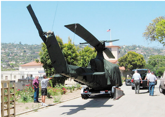
Bell 204/205 Full Body Cover Set

This cover type is made from Silver Acrylic Sunbrella canvas and is 100% lined with a soft and smooth microfiber. Bruce's Custom Covers developed this material combination especially for aircraft protection. The outer material is medium weight and treated for water resistance, UV resistance and anti-static buildup. The inner lining is a very soft and smooth microfiber to prevent scratching. The material is very reflective, and tests show that the cabin interior temperature can be reduced to near-ambient temperature on the hottest of days. It is water, ice and snow repellent, yet breathable to allow moisture to escape from between the cover and the aircraft surface.