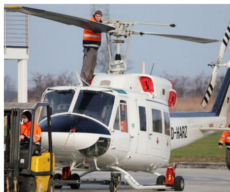
Bell 212 Main and Oil Cooler Intake Plugs