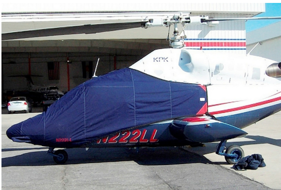
Bell 222 Bubble Cover

This cover type is made from Silver Acrylic Sunbrella canvas and is 100% lined with a soft and smooth microfiber. Bruce's Custom Covers developed this material combination especially for aircraft protection. The outer material is medium weight and treated for water resistance, UV resistance and anti-static buildup. The inner lining is a very soft and smooth microfiber to prevent scratching. The material is very reflective, and tests show that the cabin interior temperature can be reduced to near-ambient temperature on the hottest of days. It is water, ice and snow repellent, yet breathable to allow moisture to escape from between the cover and the aircraft surface.