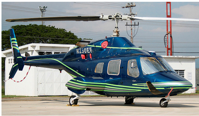
Bell 230 Engine Plugs, HeatShields