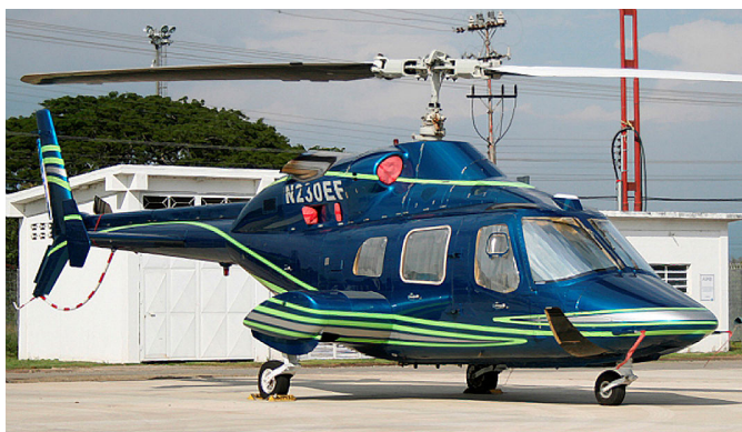
Bell 230 Engine Plugs, HeatShields

Heatshields are interior sunshades for an aircraft's windows or canopy glass. The product is a unique composite of closed-cell foam with a silver mylar finish. The semi-rigid design is stiff enough to stand along the inside of the windshield using sun visors or window framing. It folds up flat and easily stores in the included storage sleeve. Some designs may require velcro and suction cups. A Heatshield is an excellent short-term remedy for cockpit overheating.