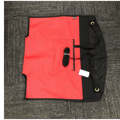
Bell 230 Blade Tie-Downs, (Semi-Rigid) W/Telescoping Attachment Handle