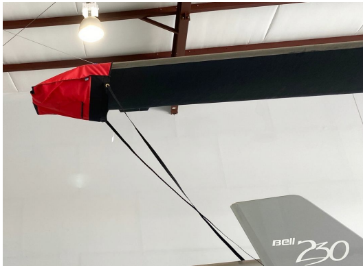
Bell 230 Blade Tie-Downs, (Semi-Rigid) W/Telescoping Attachment Handle