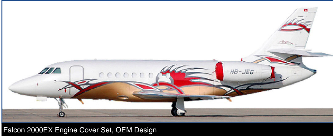
Falcon 2000EX Engine Cover Set, OEM Design