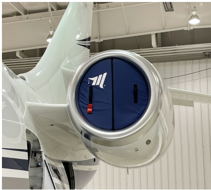
Falcon Jet Engine Inlet Plugs Folding Type

The Engine Inlet Plugs are custom fit for your Falcon Jet 2000EX, 2000LXS intakes, made with heavy-duty vinyl material, and stuffed with a single block of sculpted urethane foam. Each plug has a zipper that allows the foam to be removed and dried if necessary. Engine plugs have 'remove before flight' streamers sewn onto the face of the plugs. Most plugs are imprinted with the aircraft registration number in black for an extra charge. Storage bag NOT included. Engine plugs may be inserted after flight when the engine is still warm. Engine Inlet Plugs are commonly referred to as Cowl Plugs, Intake Plugs, Cowl Blocks, Engine Blocks, and Engine Bungs.