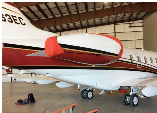
Canadair Challenger 300 Intake/Exhaust Covers, 3-Strap Type

The Falcon Jet 2000EX, 2000LXS Intake Covers are designed to install easily yet be completely storable. A spring steel hoop is sewn into the hem of each cover, allowing them to be installed without climbing onto the wing or using a stepladder. To store the covers the spring steel hoop folds like a band-saw blade into three nesting rings. Each cover folds into a compact circular bundle which is stored in the included duffle bag, yet they unfold quickly for use. The Tri-Fold Ring cover is made of medium weight nylon which is available in a variety of colors to match the paint trim. Each cover set comes complete with installation and folding instructions. The aircraft's registration number can be silkscreened onto the cover for an extra charge.