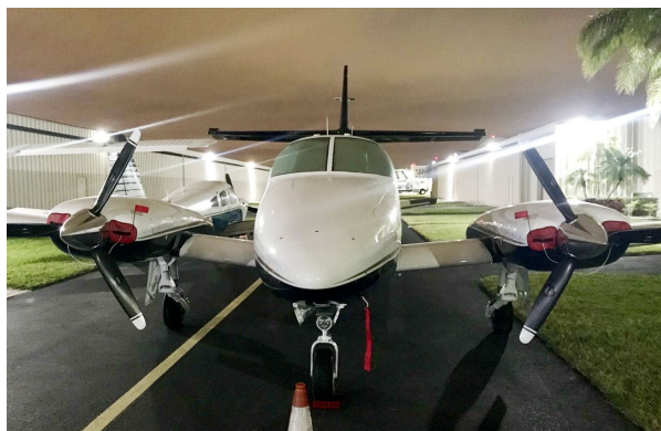
Cessna T303 Crusader Engine Inlet Plugs

single block of sculpted urethane foam. Each plug has a zipper that allows the foam to be removed and dried if necessary. Engine plugs have warning flags that are visible from the cockpit or 'remove before flight' streamers sewn onto the face of the plugs. Most plugs are imprinted with the aircraft registration number in black for an extra charge. Storage bag NOT included. Engine plugs may be inserted after flight when the engine is still warm. Engine Inlet Plugs are commonly referred to as Cowl Plugs, Intake Plugs, Cowl Blocks, Engine Blocks, and Engine Bungs.