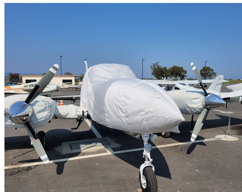
Cessna 310 Extended Canopy/Nose Cover