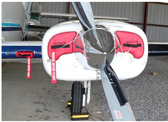
Cessna 310P Engine Inlet and Center Section Inlet Plugs