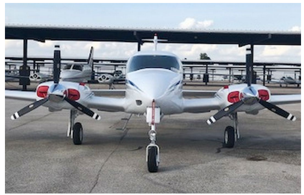
Cessna 310L Engine Inlet Plugs