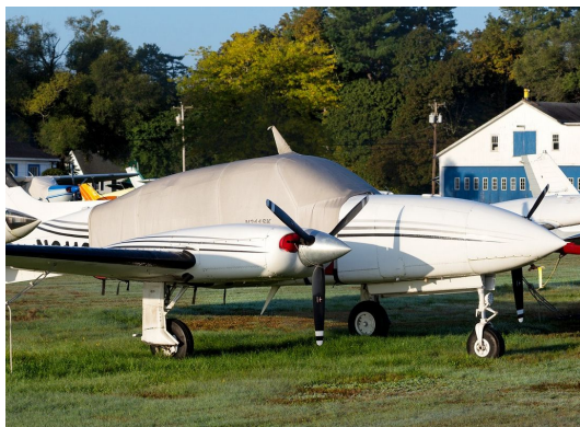
Cessna 310 Canopy Cover (St. Back, No Rear Window Models)