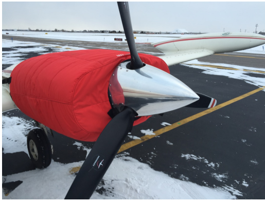
Cessna 310 Insulated Engine Cover