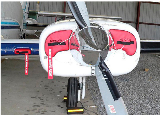
Cessna 310P Engine Inlet and Center Section Inlet Plugs

Engine Inlet Plugs are custom fit for your Cessna 320 intakes, made with heavy-duty vinyl material, and stuffed with a single block of sculpted urethane foam. Each plug has a zipper that allows the foam to be removed and dried if necessary. Engine plugs have warning flags that are visible from the cockpit or 'remove before flight' streamers sewn onto the face of the plugs. Most plugs are imprinted with the aircraft registration number in black for an extra charge. Storage bag NOT included. Engine plugs may be inserted after flight when the engine is still warm. Engine Inlet Plugs are commonly referred to as Cowl Plugs, Intake Plugs, Cowl Blocks, Engine Blocks, and Engine Bungs.