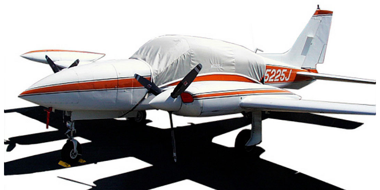
Cessna 310Q Canopy Cover