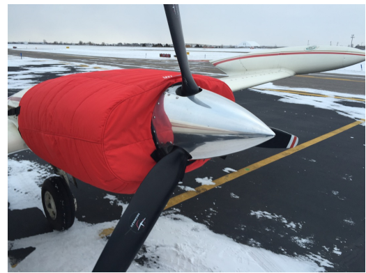
Cessna 310 Insulated Engine Cover