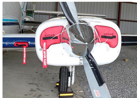
Cessna 310P Engine Inlet and Center Section Inlet Plugs