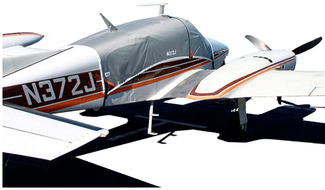
Cessna 320 Canopy Cover