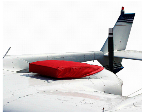
Cessna 337 Skymaster Aft Engine Cover