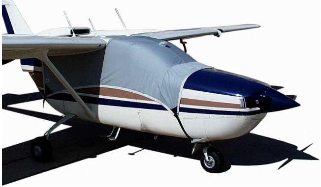
Cessna Skymaster Canopy Cover with Forward Extension

This cover type is made from Silver Acrylic Sunbrella canvas and is 100% lined with a soft and smooth microfiber. Bruce's Custom Covers developed this material combination especially for aircraft protection. The outer material is medium weight and treated for water resistance, UV resistance and anti-static buildup. The inner lining is a very soft and smooth microfiber to prevent scratching. The material is very reflective, and tests show that the cabin interior temperature can be reduced to near-ambient temperature on the hottest of days. It is water, ice and snow repellent, yet breathable to allow moisture to escape from between the cover and the aircraft surface.