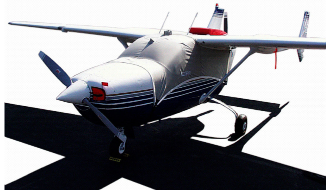
Cessna Skymaster Canopy Cover with Forward Extension, Fwd. Engine Plugs, Aft Engine Cover