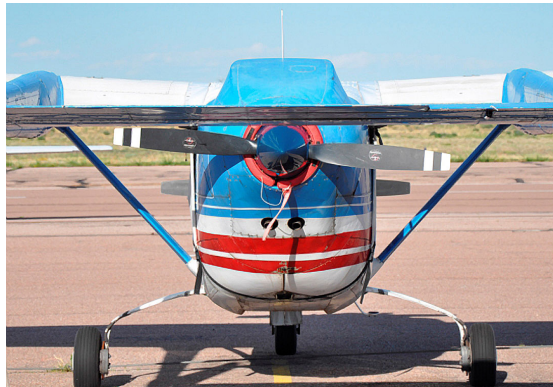
Cessna 337 Skymaster Aft Engine Inlet Plugs

Engine Inlet Plugs are custom fit for your Cessna 336 (Fixed Gear Skymaster) intakes, made with heavy-duty vinyl material, and stuffed with a single block of sculpted urethane foam. Each plug has a zipper that allows the foam to be removed and dried if necessary. Engine plugs have warning flags that are visible from the cockpit or 'remove before flight' streamers sewn onto the face of the plugs. Most plugs are imprinted with the aircraft registration number in black for an extra charge. Storage bag NOT included. Engine plugs may be inserted after flight when the engine is still warm. Engine Inlet Plugs are commonly referred to as Cowl Plugs, Intake Plugs, Cowl Blocks, Engine Blocks, and Engine Bung.