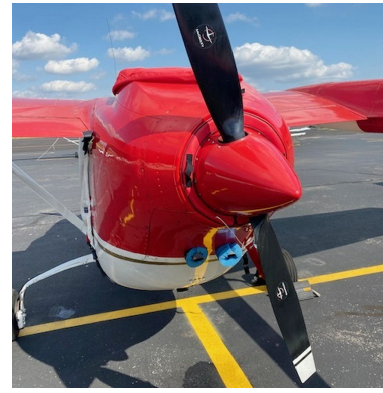
Cessna 337 Skymaster Aft Engine Prop Base Plugs