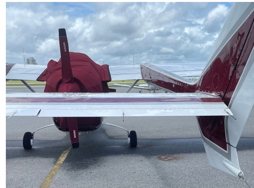
Cessna 337 Skymaster Over-Top Canopy/Engine Cover