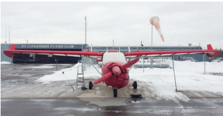
Cessna 337 Skymaster Winter Cover Set

This cover type is made from Silver Acrylic Sunbrella canvas and is 100% lined with a soft and smooth microfiber. Bruce's Custom Covers developed this material combination especially for aircraft protection. The outer material is medium weight and treated for water resistance, UV resistance and anti-static buildup. The inner lining is a very soft and smooth microfiber to prevent scratching. The material is very reflective, and tests show that the cabin interior temperature can be reduced to near-ambient temperature on the hottest of days. It is water, ice and snow repellent, yet breathable to allow moisture to escape from between the cover and the aircraft surface.