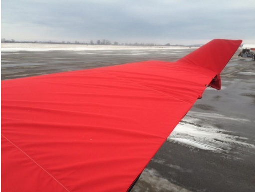
Cessna 337 Skymaster Wing Covers, with winglets

WINTER USE MATERIAL - Made with Solution-Dyed Polyester fabric, this option is intended for seasonal use to aid in deicing, rain mitigation, or for occasional travel. The material is lighter and more compact, but more susceptible to UV damage and may have a shorter useful life if used continuously outside than the all-year use material.