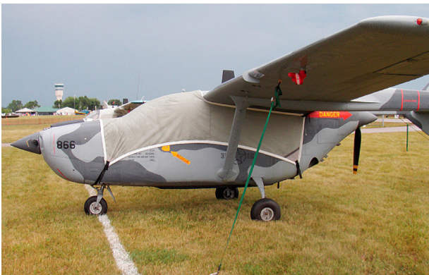
Cessna 337 Skymaster Canopy Cover w/ 14" bib ext. & Pitot Cover Set

This cover type is made from Silver Acrylic Sunbrella canvas and is 100% lined with a soft and smooth microfiber. Bruce's Custom Covers developed this material combination especially for aircraft protection. The outer material is medium weight and treated for water resistance, UV resistance and anti-static buildup. The inner lining is a very soft and smooth microfiber to prevent scratching. The material is very reflective, and tests show that the cabin interior temperature can be reduced to near-ambient temperature on the hottest of days. It is water, ice and snow repellent, yet breathable to allow moisture to escape from between the cover and the aircraft surface.