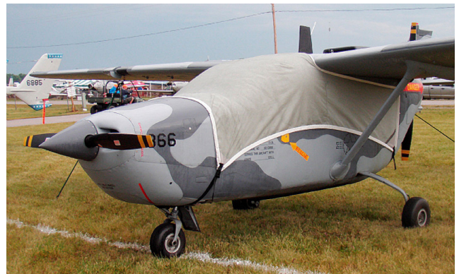
Cessna 337 Skymaster Canopy Cover w/ 14" bib ext.