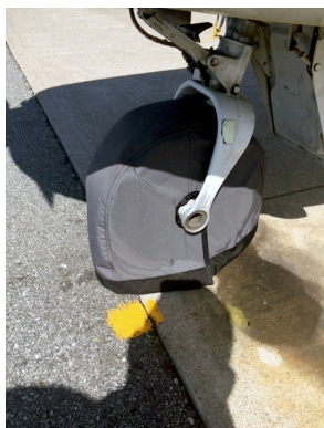
Cessna 337 Skymaster (O-2, O-2A) Tire Covers

ALL-YEAR USE MATERIAL - Made with Silver Acrylic Sunbrella canvas, the all-year use material is the best option for sun protection and cover longevity. This heavier more durable material is intended for all weather conditions, such as rain and snow or lots of sun.