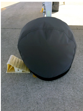
Cessna 337 Skymaster (O-2, O-2A) Tire Covers

The Cessna 337 Skymaster (O-2, O-2A) Tailcone Cover fits onto the tailcone area to cover the holes that birds can fly into and nest. The cover easily straps onto the leading edge of the horizontal stabilizer with padded hooks or overlaps with the elevators slightly and attaches under the horizontal stabilizers with adjustable straps. Tailcone Covers are normally made with Solution-Dyed Polyester or Acrylic Sunbrella .