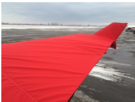
Cessna 337 Skymaster Wing Covers, with winglets

WINTER USE MATERIAL - Made with Solution-Dyed Polyester fabric, this option is intended for seasonal use to aid in deicing, rain mitigation, or for occasional travel. The material is lighter and more compact, but more susceptible to UV damage and may have a shorter useful life if used continuously outside than the all-year use material.