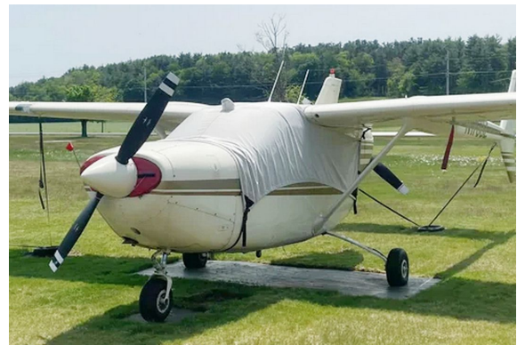
Cessna 337 Skymaster Canopy Cover With 14" Bib Ext.