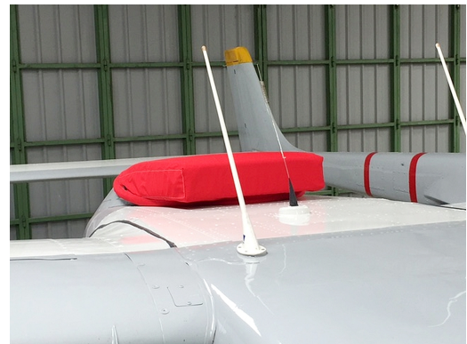
Cessna 337 Skymaster Aft Engine Inlet Cover, hoop type