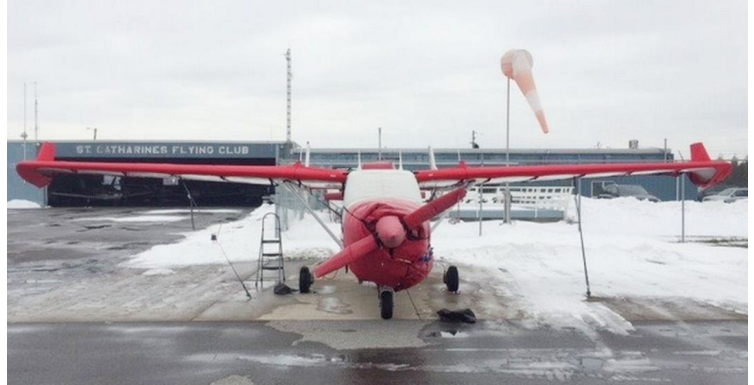
Cessna 337 Skymaster Winter Cover Set