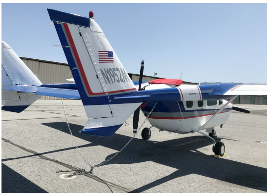
Cessna Skymaster 337G Rear Engine Inlet Cover

This cover type is made from Silver Acrylic Sunbrella canvas and is 100% lined with a soft and smooth microfiber. Bruce's Custom Covers developed this material combination especially for aircraft protection. The outer material is medium weight and treated for water resistance, UV resistance and anti-static buildup. The inner lining is a very soft and smooth microfiber to prevent scratching. The material is very reflective, and tests show that the cabin interior temperature can be reduced to near-ambient temperature on the hottest of days. It is water, ice and snow repellent, yet breathable to allow moisture to escape from between the cover and the aircraft surface.