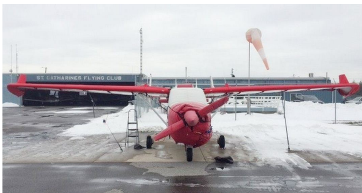
Cessna 337 Skymaster Winter Cover Set