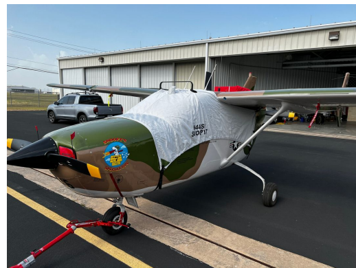
Cessna 337 Skymaster Canopy Cover with 14" bib ext., Engine Plugs