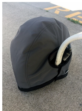
Cessna 337 Skymaster (O-2, O-2A) Tire Covers