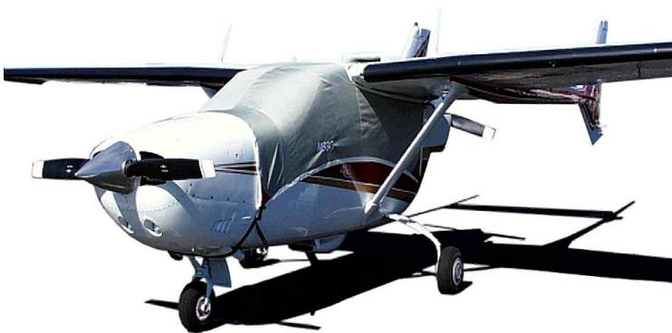
Cessna Skymaster Canopy Cover w/ 14" bib ext.

This cover type is made from Silver Acrylic Sunbrella canvas and is 100% lined with a soft and smooth microfiber. Bruce's Custom Covers developed this material combination especially for aircraft protection. The outer material is medium weight and treated for water resistance, UV resistance and anti-static buildup. The inner lining is a very soft and smooth microfiber to prevent scratching. The material is very reflective, and tests show that the cabin interior temperature can be reduced to near-ambient temperature on the hottest of days. It is water, ice and snow repellent, yet breathable to allow moisture to escape from between the cover and the aircraft surface.