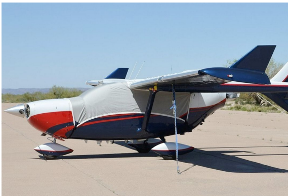
Canopy Cover with Forward Extension

This cover type is made from Silver Acrylic Sunbrella canvas and is 100% lined with a soft and smooth microfiber. Bruce's Custom Covers developed this material combination especially for aircraft protection. The outer material is medium weight and treated for water resistance, UV resistance and anti-static buildup. The inner lining is a very soft and smooth microfiber to prevent scratching. The material is very reflective, and tests show that the cabin interior temperature can be reduced to near-ambient temperature on the hottest of days. It is water, ice and snow repellent, yet breathable to allow moisture to escape from between the cover and the aircraft surface.