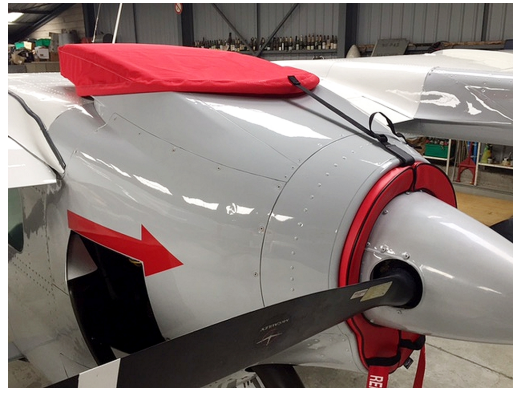
Cessna 337 Skymaster Aft Engine Inlet Cover, hoop type, & outlet plugs (SOLD SEPARATELY)