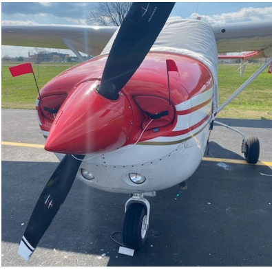
Cessna 337 Skymaster Fwd Engine Intake Plugs