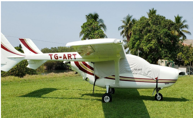
Cessna 337 Skymaster Canopy Cover w/14" Bib Extension

This cover type is made from Silver Acrylic Sunbrella canvas and is 100% lined with a soft and smooth microfiber. Bruce's Custom Covers developed this material combination especially for aircraft protection. The outer material is medium weight and treated for water resistance, UV resistance and anti-static buildup. The inner lining is a very soft and smooth microfiber to prevent scratching. The material is very reflective, and tests show that the cabin interior temperature can be reduced to near-ambient temperature on the hottest of days. It is water, ice and snow repellent, yet breathable to allow moisture to escape from between the cover and the aircraft surface.