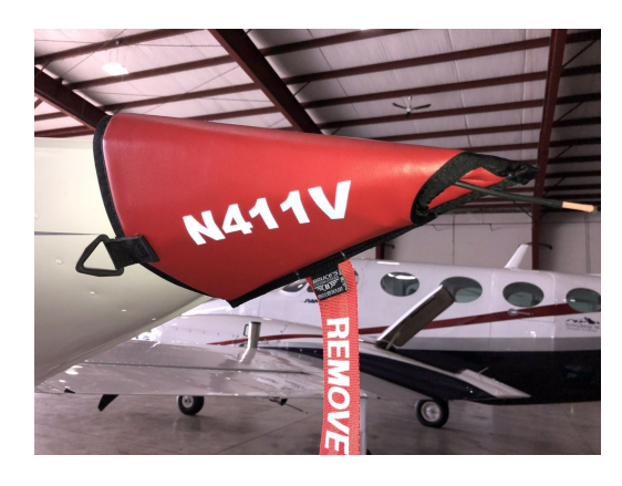
Cessna 335, 340 Wingtip Pads

Designed to prevent damage to the aircraft extremities in crowded hangars, these products are made of bright red Naugahyde and thickly padded with a sandwich of closed cell foam.