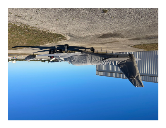
Cessna 340A Extended Canopy, Wing, Insulated Engine & Prop Covers Cessna 340 Empennage Cover, Wing/Engine Covers