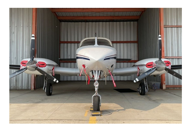
Cessna 340 Engine Plugs, Pitot Covers

Engine Inlet Plugs are custom fit for your Cessna 335, 340 intakes, made with heavy-duty vinyl material, and stuffed with a single block of sculpted urethane foam. Each plug has a zipper that allows the foam to be removed and dried if necessary. Engine plugs have warning flags that are visible from the cockpit or 'remove before flight' streamers sewn onto the face of the plugs. Most plugs are imprinted with the aircraft registration number in black for an extra charge. Storage bag NOT included. Engine plugs may be inserted after flight when the engine is still warm. Engine Inlet Plugs are commonly referred to as Cowl Plugs, Intake Plugs, Cowl Blocks, Engine Blocks, and Engine Bungs.