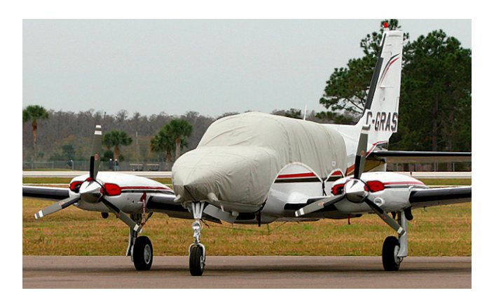
Cessna 340 Canopy/Nose Cover & Engine Inlet Plugs