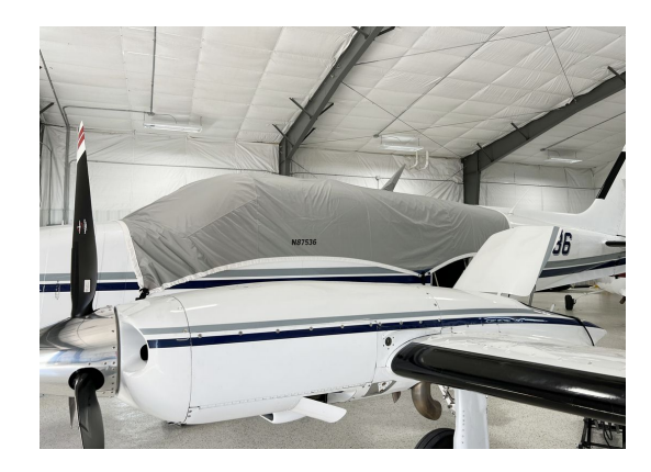
Cessna 340A Travel Weight Canopy Cover

Travel Covers are made with Silver Solution-Dyed Polyester fabric and only lined over the windshield to save weight. The material is lightweight and more compact for easy stowage in the aircraft. The polyester material is water resistant, but only intended for occasional use outside. We also have an ultra lightweight material available for fitted hangar dust covers. For daily outdoor use, the non-travel Sunbrella Cover is the best choice.