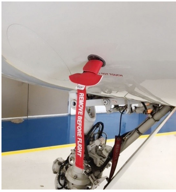
Grumman Gulfstream G-V Rosemont/TAT Cover