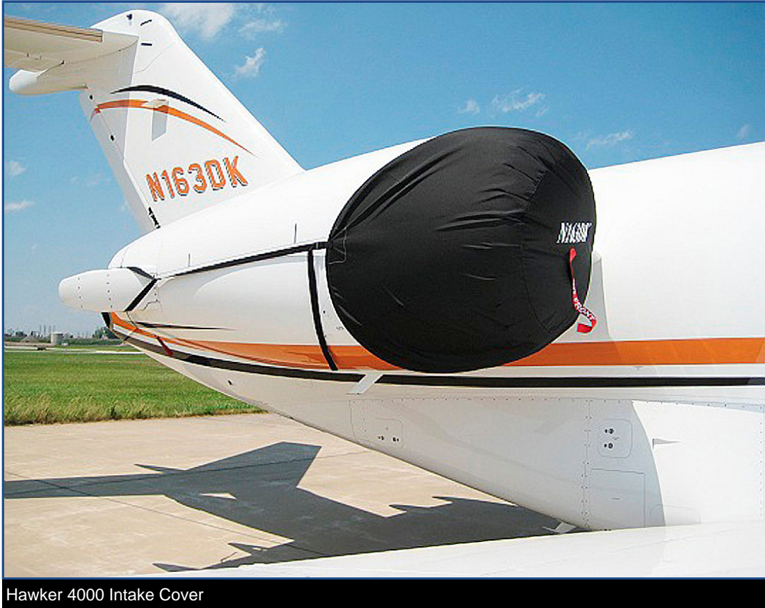
Hawker 4000 Intake Cover