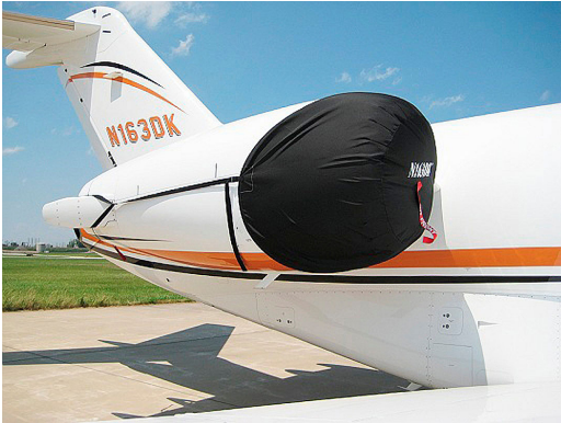
Hawker 4000 Intake Cover

The Hawker Beechcraft 4000 Horizon Intake Covers are designed to install easily yet be completely storable. A spring steel hoop is sewn into the hem of each cover, allowing them to be installed without climbing onto the wing or using a stepladder. To store the covers the spring steel hoop folds like a band-saw blade into three nesting rings. Each cover folds into a compact circular bundle which is stored in the included duffle bag, yet they unfold quickly for use. The Tri-Fold Ring cover is made of medium weight nylon which is available in a variety of colors to match the paint trim. Each cover set comes complete with installation and folding instructions. The aircraft's registration number can be silkscreened onto the cover for an extra charge.