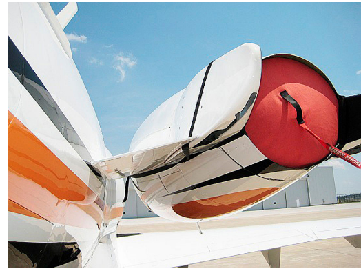
Hawker 4000 Exhaust Plug