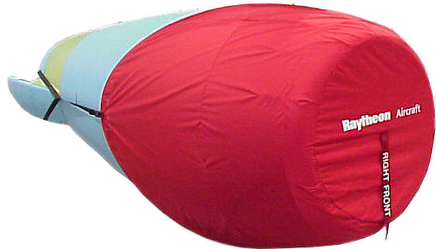
Hawker 4000 Intake Cover