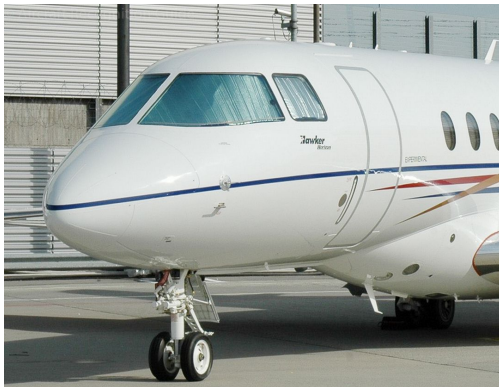
Hawker Beechcraft 4000 Horizon Cockpit Heatshields

Cockpit Heatshields are interior sunshades for the aircraft's cockpit. The product is a unique composite of closed-cell foam with a silver mylar finish. The semi-rigid design is stiff enough to stand inside the window framing. The set folds up flat and is easily stored in the included storage sleeve. Some designs may require velcro and suction cups. Our Heatshields for jets are offered white side out because some aircraft manufacturers have issued advisories against reflective window inserts due to potential heat damage. A Heatshield is an excellent short-term remedy for cockpit overheating, but an external fabric cover is more effective for long-term protection.