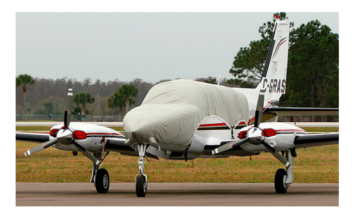
Cessna 340 Canopy/Nose Cover & Engine Inlet Plugs