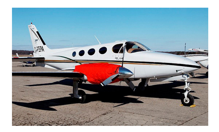
Cessna 340 Insulated Engine Covers