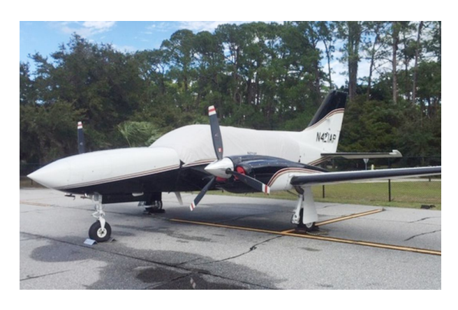
Cessna 421 Canopy Cover, Engine Plugs