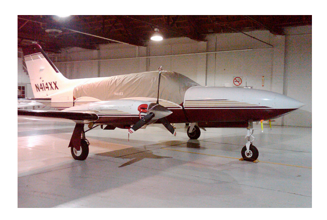
Cessna 414 Canopy Cover and Engine Inlet Plugs