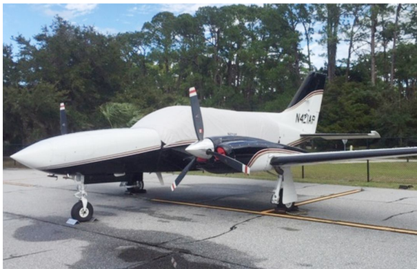
Cessna 421 Canopy Cover, Engine Plugs

The Cessna 402 Nose Cover is designed to cover the section of the fuselage forward of the windshield to the tip of the nose. It is secured with belly straps. This cover type is made from Silver Acrylic Sunbrella canvas and is 100% lined with a soft and smooth microfiber. Bruce's Custom Covers developed this material combination especially for aircraft protection. The outer material is medium weight and treated for water resistance, UV resistance and anti-static buildup. The inner lining is a very soft and smooth microfiber to prevent scratching. The material is very reflective, and tests show that the cabin interior temperature can be reduced to near-ambient temperature on the hottest of days. It is water, ice and snow repellent, yet breathable to allow moisture to escape from between the cover and the aircraft surface.