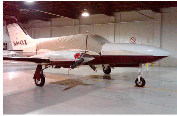
Cessna 414 Canopy Cover and Engine Inlet Plugs