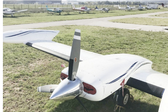
Cessna 340 Engine Inlet Plugs