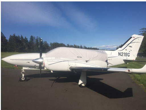
Cessna 421C Canopy Cover

The Cessna 402 Nose Cover is designed to cover the section of the fuselage forward of the windshield to the tip of the nose. It is secured with belly straps. This cover type is made from Silver Acrylic Sunbrella canvas and is 100% lined with a soft and smooth microfiber. Bruce's Custom Covers developed this material combination especially for aircraft protection. The outer material is medium weight and treated for water resistance, UV resistance and anti-static buildup. The inner lining is a very soft and smooth microfiber to prevent scratching. The material is very reflective, and tests show that the cabin interior temperature can be reduced to near-ambient temperature on the hottest of days. It is water, ice and snow repellent, yet breathable to allow moisture to escape from between the cover and the aircraft surface.