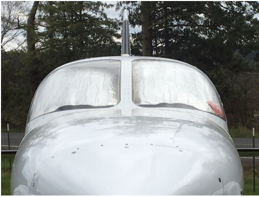
Cessna 421 Windshield HeatShields

window framing. It folds up flat and easily stores in the included storage sleeve. Some designs may require velcro and suction cups. A Heatshield is an excellent short-term remedy for cockpit overheating.