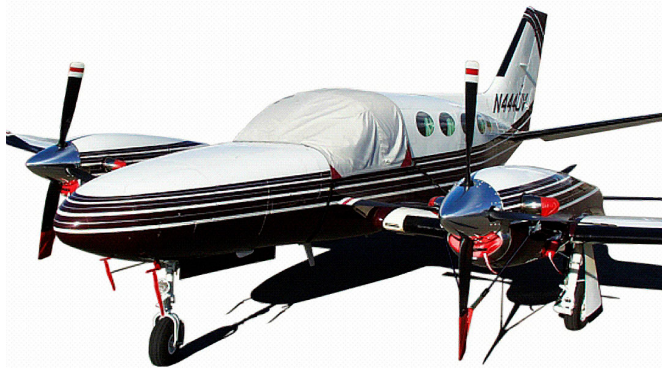
Cessna 425 Cockpit Cover

This cover type is made from Silver Acrylic Sunbrella canvas and is 100% lined with a soft and smooth microfiber. Bruce's Custom Covers developed this material combination especially for aircraft protection. The outer material is medium weight and treated for water resistance, UV resistance and anti-static buildup. The inner lining is a very soft and smooth microfiber to prevent scratching. The material is very reflective, and tests show that the cabin interior temperature can be reduced to near-ambient temperature on the hottest of days. It is water, ice and snow repellent, yet breathable to allow moisture to escape from between the cover and the aircraft surface.