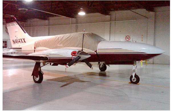
Cessna 414 Canopy Cover and Engine Inlet Plugs