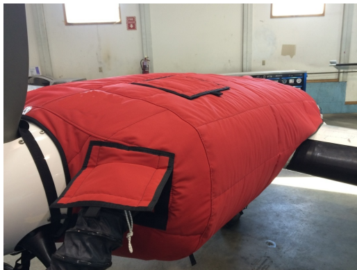
Cessna 402 Insulated Engine Cover with Heater

This cover type is made from Silver Acrylic Sunbrella canvas and is 100% lined with a soft and smooth microfiber. Bruce's Custom Covers developed this material combination especially for aircraft protection. The outer material is medium weight and treated for water resistance, UV resistance and anti-static buildup. The inner lining is a very soft and smooth microfiber to prevent scratching. The material is very reflective, and tests show that the cabin interior temperature can be reduced to near-ambient temperature on the hottest of days. It is water, ice and snow repellent, yet breathable to allow moisture to escape from between the cover and the aircraft surface.