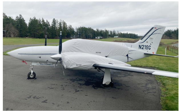
Cessna 421C Canopy & Engine Covers