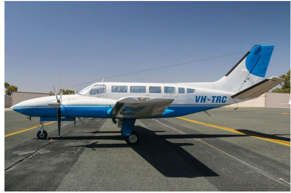
Cessna 404 & F406 HeatShields