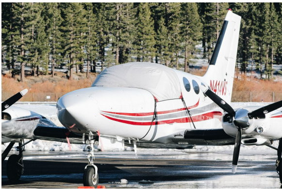
Cessna 414 Cockpit Cover

This cover type is made from Silver Acrylic Sunbrella canvas and is 100% lined with a soft and smooth microfiber. Bruce's Custom Covers developed this material combination especially for aircraft protection. The outer material is medium weight and treated for water resistance, UV resistance and anti-static buildup. The inner lining is a very soft and smooth microfiber to prevent scratching. The material is very reflective, and tests show that the cabin interior temperature can be reduced to near-ambient temperature on the hottest of days. It is water, ice and snow repellent, yet breathable to allow moisture to escape from between the cover and the aircraft surface.