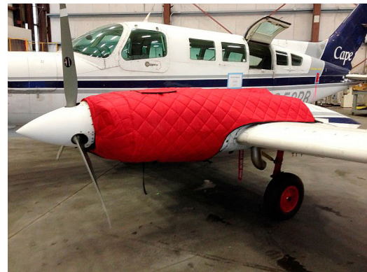
Cessna 402 Insulated Engine Cover