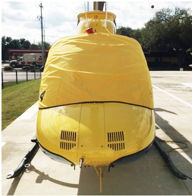
Yellow Windshield Cover with artwork

Travel Covers are made with Silver Solution-Dyed Polyester fabric and fully lined over the entire cover. The material is lightweight and more compact for easy storage in the aircraft. The polyester material is water resistant, but only intended for occasional use outside. We also have an ultra lightweight material available for fitted hangar dust covers. For daily outdoor use, the non-travel Sunbrella Cover is the best choice.