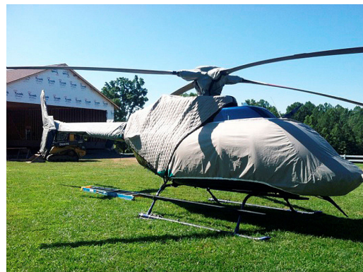
Bell 407 Covers: Bubble, Insulated Engine, Rotor Mast, Blades, Tailboom, Vertical Stabilizer and Tail Rotor