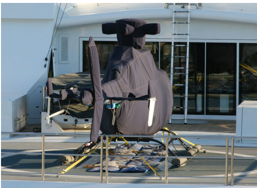
Bell 407 Complete Cover Set

The Tailboom Cover details vary by model, but generally the helicopter tail boom cover encloses the tail boom from the "bottleneck" to the aft end. They usually also cover the horizontal stabilizers, and are custom made to allow for antennae, lights, and other protrusions. They attach with straps underneath the tail boom. Covers for the vertical and horizontal stabilizers are also available separately. Specific information for each model is available on request.