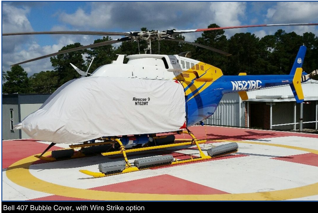
Bell 407 Bubble Cover, with Wire Strike option