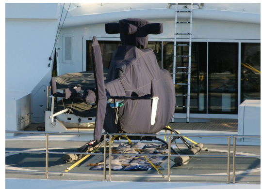
Bell 407 Complete Cover Set