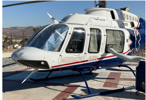
Bell 407 Windshield HeatShields