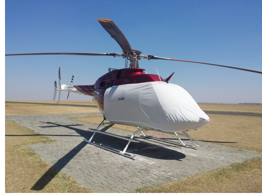
Bell 407 Bubble Cover with Wire Strike