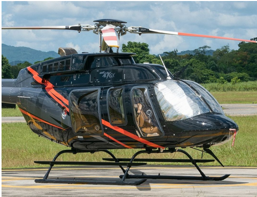
Bell 407 Windshield Heatshields

Heatshields are interior sunshades for an aircraft's windows or canopy glass. The product is a unique composite of closed-cell foam with a silver mylar finish. The semi-rigid design is stiff enough to stand along the inside of the windshield using sun visors or window framing. It folds up flat and easily stores in the included storage sleeve. Some designs may require velcro and suction cups. A Heatshield is an excellent short-term remedy for cockpit overheating.