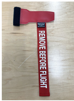
Pitot Tube Cover