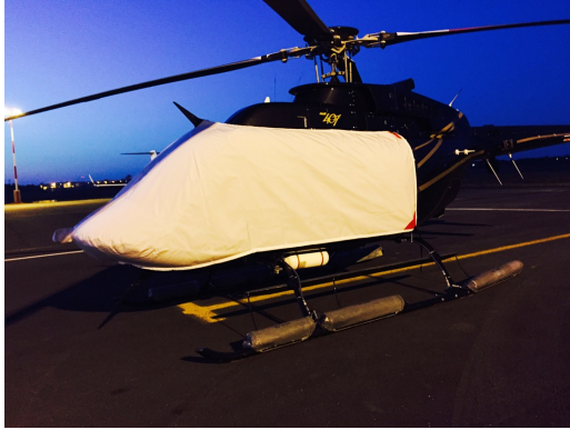
Bell 407 Bubble Cover with Wire Strike

This cover type is made from Silver Acrylic Sunbrella canvas and is 100% lined with a soft and smooth microfiber. Bruce's Custom Covers developed this material combination especially for aircraft protection. The outer material is medium weight and treated for water resistance, UV resistance and anti-static buildup. The inner lining is a very soft and smooth microfiber to prevent scratching. The material is very reflective, and tests show that the cabin interior temperature can be reduced to near-ambient temperature on the hottest of days. It is water, ice and snow repellent, yet breathable to allow moisture to escape from between the cover and the aircraft surface.