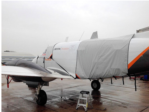
King Air Cargo/Jump Door Rain Cover

This cover type is made from Silver Acrylic Sunbrella canvas and is 100% lined with a soft and smooth microfiber. Bruce's Custom Covers developed this material combination especially for aircraft protection. The outer material is medium weight and treated for water resistance, UV resistance and anti-static buildup. The inner lining is a very soft and smooth microfiber to prevent scratching. The material is very reflective, and tests show that the cabin interior temperature can be reduced to near-ambient temperature on the hottest of days. It is water, ice and snow repellent, yet breathable to allow moisture to escape from between the cover and the aircraft surface.