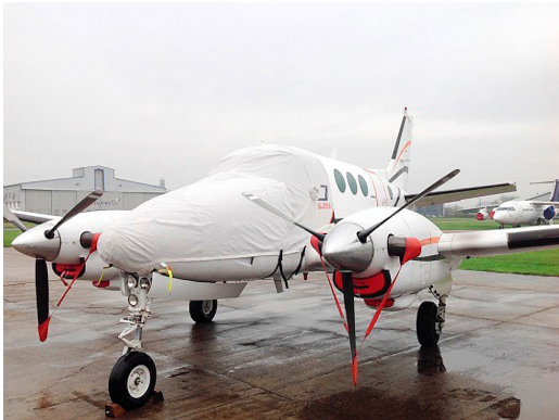
King Air Cockpit/Nose Cover, Plugs, Prop Tie/Exhaust Covers

This cover type is made from Silver Acrylic Sunbrella canvas and is 100% lined with a soft and smooth microfiber. Bruce's Custom Covers developed this material combination especially for aircraft protection. The outer material is medium weight and treated for water resistance, UV resistance and anti-static buildup. The inner lining is a very soft and smooth microfiber to prevent scratching. The material is very reflective, and tests show that the cabin interior temperature can be reduced to near-ambient temperature on the hottest of days. It is water, ice and snow repellent, yet breathable to allow moisture to escape from between the cover and the aircraft surface.