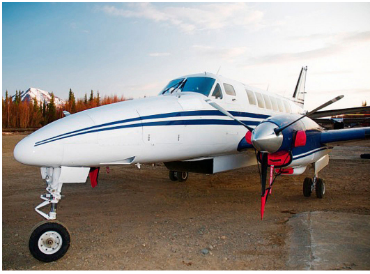
Beech 99 Engine Plugs & Prop Ties