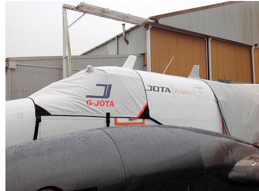
King Air Windshield/Cockpit Cover