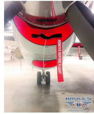
Engine and Oil Cooler Inlet Plugs