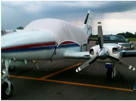
Cessna 401B Canopy Cover