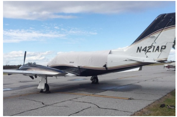
Cessna 421 Canopy Cover