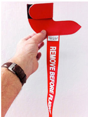
Standard Pitot Cover

Engine Inlet Plugs are custom fit for your Cessna 411 intakes, made with heavy-duty vinyl material, and stuffed with a single block of sculpted urethane foam. Each plug has a zipper that allows the foam to be removed and dried if necessary. Engine plugs have warning flags that are visible from the cockpit or 'remove before flight' streamers sewn onto the face of the plugs. Most plugs are imprinted with the aircraft registration number in black for an extra charge. Storage bag NOT included. Engine plugs may be inserted after flight when the engine is still warm. Engine Inlet Plugs are commonly referred to as Cowl Plugs, Intake Plugs, Cowl Blocks, Engine Blocks, and Engine Bungs.