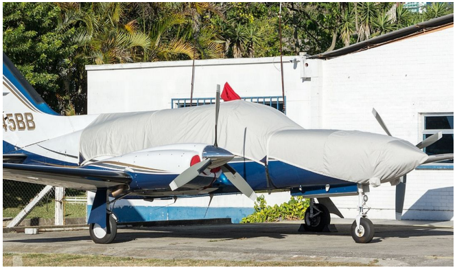
Cessna 421 Canopy Cover & Nose Cover