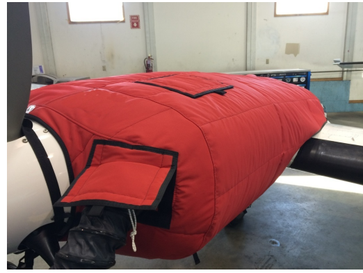
Cessna 402 Insulated Engine Cover with Heater