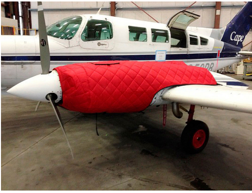
Cessna 402 Insulated Engine Cover