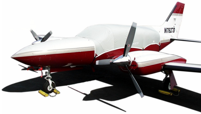
Cessna 421C Canopy Cover & Engine Plugs