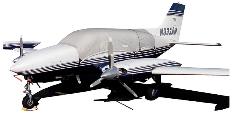
Cessna 414 Canopy Cover & Pitot Covers