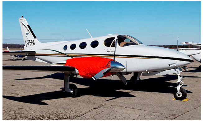
Cessna 340 Insulated Engine Covers