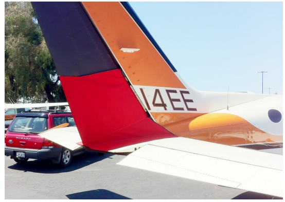
Cessna 414 Rudder Openings Cover (bird barrier)