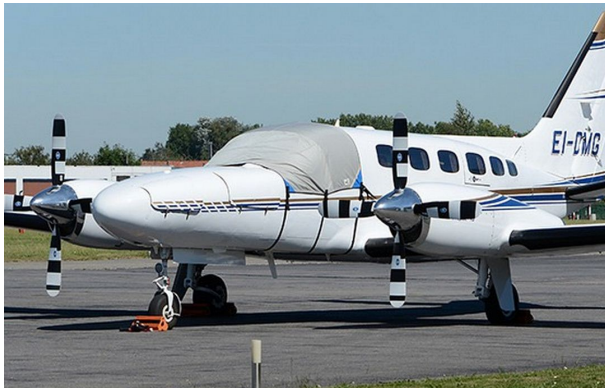
Cessna 441 Cockpit Cover