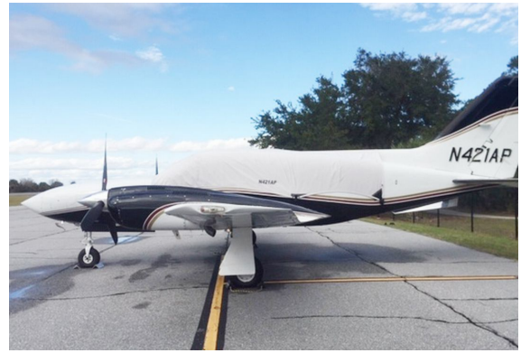
Cessna 421 Canopy Cover