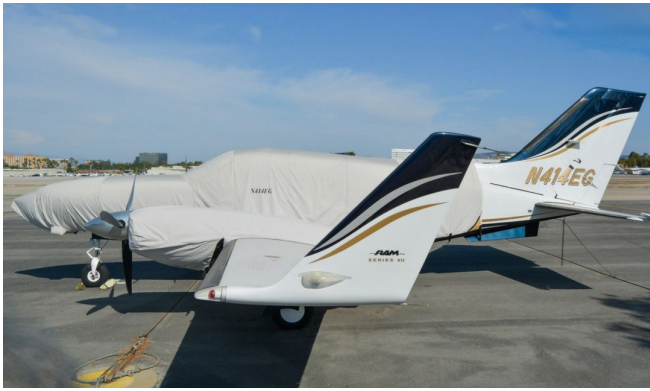
Cessna 414A Extended Canopy/Nose Cover & Engine Covers