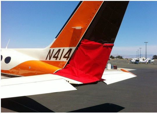
Cessna 414 Rudder Openings Cover (bird barrier)