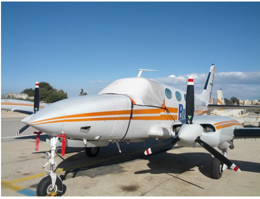
Cessna 340 Cockpit/Windshield Cover