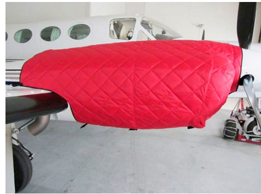
Cessna 421 Insulated Engine Covers