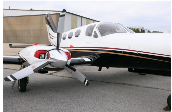
Cessna 414 Engine Inlet Plugs