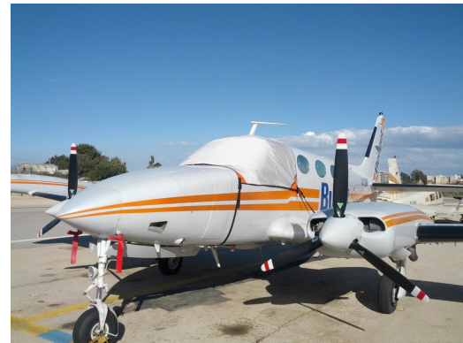
Cessna 340 Cockpit/Windshield Cover