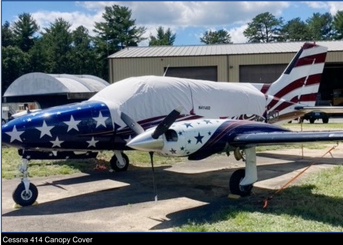
Cessna 414 Canopy Cover