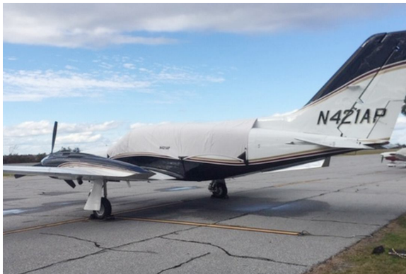
Cessna 421 Canopy Cover

This cover type is made from Silver Acrylic Sunbrella canvas and is 100% lined with a soft and smooth microfiber. Bruce's Custom Covers developed this material combination especially for aircraft protection. The outer material is medium weight and treated for water resistance, UV resistance and anti-static buildup. The inner lining is a very soft and smooth microfiber to prevent scratching. The material is very reflective, and tests show that the cabin interior temperature can be reduced to near-ambient temperature on the hottest of days. It is water, ice and snow repellent, yet breathable to allow moisture to escape from between the cover and the aircraft surface.