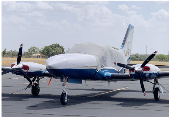
Cessna 414 Travel Weight Canopy Cover, Engine Plugs

Engine Inlet Plugs are custom fit for your Cessna 414 intakes, made with heavy-duty vinyl material, and stuffed with a single block of sculpted urethane foam. Each plug has a zipper that allows the foam to be removed and dried if necessary. Engine plugs have warning flags that are visible from the cockpit or 'remove before flight' streamers sewn onto the face of the plugs. Most plugs are imprinted with the aircraft registration number in black for an extra charge. Storage bag NOT included. Engine plugs may be inserted after flight when the engine is still warm. Engine Inlet Plugs are commonly referred to as Cowl Plugs, Intake Plugs, Cowl Blocks, Engine Blocks, and Engine Bungs.