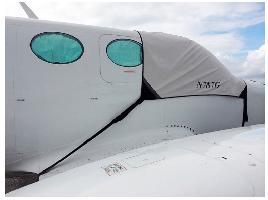
Cessna 340 Cockpit/Windshield Cover