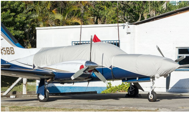
Cessna 421 Canopy Cover & Nose Cover