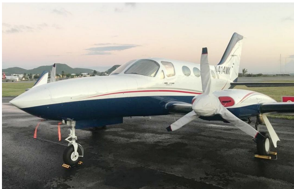
Cessna 414 Propellor/Spinner Covers, 3 Blade

Heatshields are interior sunshades for an aircraft's windows or canopy glass. The product is a unique composite of closed-cell foam with a silver mylar finish. The semi-rigid design is stiff enough to stand along the inside of the windshield using sun visors or window framing. It folds up flat and easily stores in the included storage sleeve. Some designs may require velcro and suction cups. A Heatshield is an excellent short-term remedy for cockpit overheating.