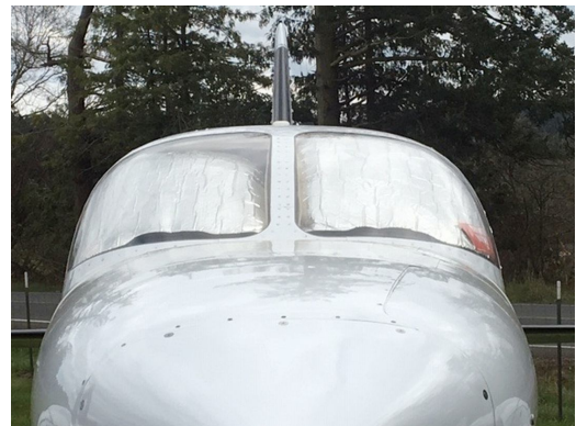
Cessna 421 Windshield HeatShields