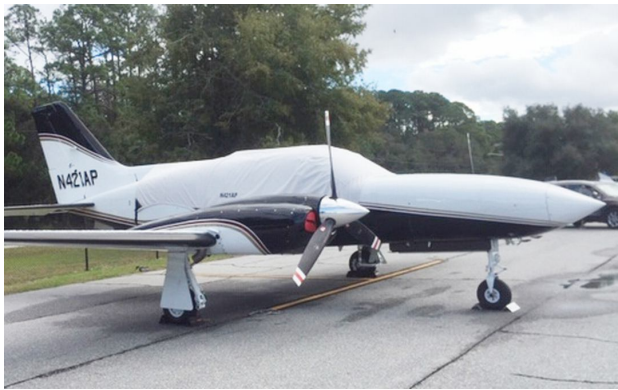
Cessna 421 Canopy Cover, Engine Plugs

This cover type is made from Silver Acrylic Sunbrella canvas and is 100% lined with a soft and smooth microfiber. Bruce's Custom Covers developed this material combination especially for aircraft protection. The outer material is medium weight and treated for water resistance, UV resistance and anti-static buildup. The inner lining is a very soft and smooth microfiber to prevent scratching. The material is very reflective, and tests show that the cabin interior temperature can be reduced to near-ambient temperature on the hottest of days. It is water, ice and snow repellent, yet breathable to allow moisture to escape from between the cover and the aircraft surface.