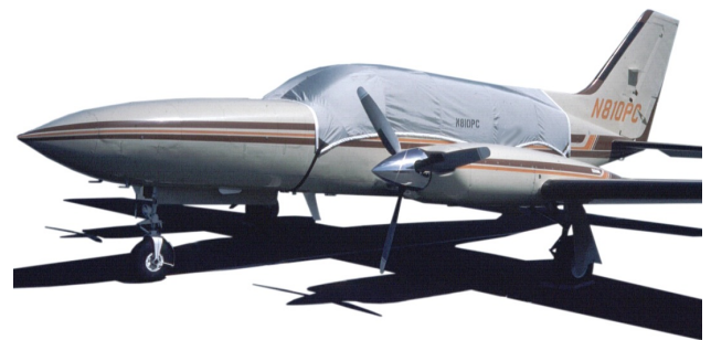
Cessna 421 Cockpit/Windshield Cover