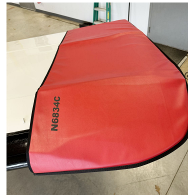
Cessna 421C Wingtip Pads