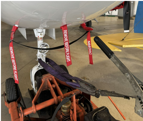
Cessna 421C Pitot Covers, Nose Inlet Plug

Engine Inlet Plugs are custom fit for your Cessna 421 intakes, made with heavy-duty vinyl material, and stuffed with a single block of sculpted urethane foam. Each plug has a zipper that allows the foam to be removed and dried if necessary. Engine plugs have warning flags that are visible from the cockpit or 'remove before flight' streamers sewn onto the face of the plugs. Most plugs are imprinted with the aircraft registration number in black for an extra charge. Storage bag NOT included. Engine plugs may be inserted after flight when the engine is still warm. Engine Inlet Plugs are commonly referred to as Cowl Plugs, Intake Plugs, Cowl Blocks, Engine Blocks, and Engine Bungs.