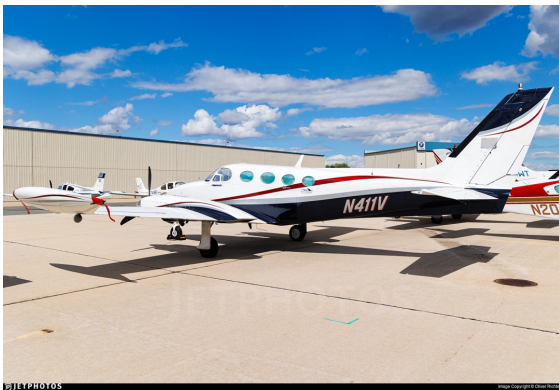
Cessna 340 Wingtip Pads

Designed to prevent damage to the aircraft extremities in crowded hangars, these products are made of bright red Naugahyde and thickly padded with a sandwich of closed cell foam. Nowadays they are also made using bright red Neoprene padded laminated (think: wetsuit material).