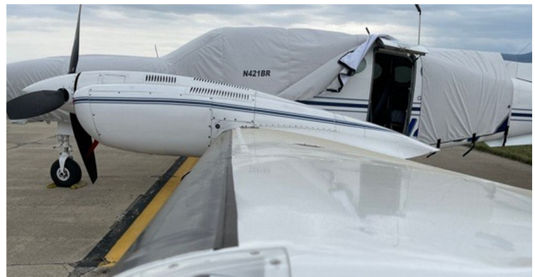
Cessna 421 Extended Canopy/Nose Cover with zipper access