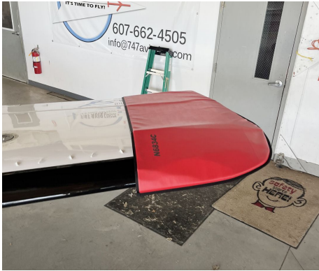
Cessna 421C Wingtip Pads

Designed to prevent damage to the aircraft extremities in crowded hangars, these products are made of bright red Naugahyde and thickly padded with a sandwich of closed cell foam.