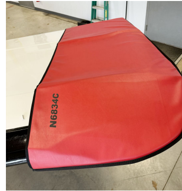
Cessna 421C Wingtip Pads