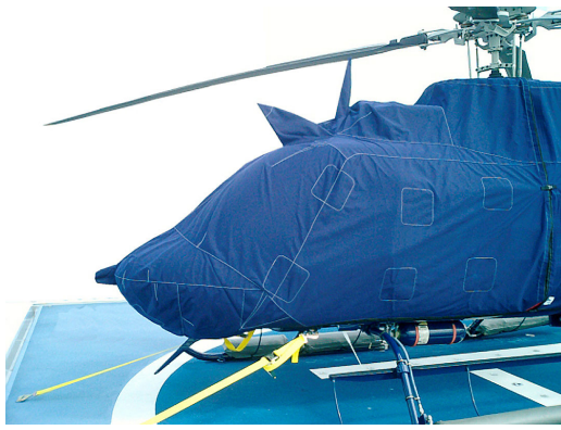
206B/206L/407 Full Body Cover