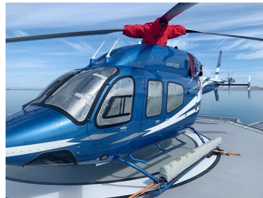
Bell 429 Rotor Hub Cover, Cockpit & Cabin HeatShields