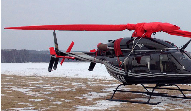
Bell 427 Rotor Blades, Main Rotor Hub/Drive Shafts, Horiz. Stabs, Tail Rotor Covers

WINTER USE MATERIAL - Made with Solution-Dyed Polyester fabric, this option is intended for seasonal use to aid in deicing, rain mitigation, or for occasional travel. The material is lighter and more compact, but more susceptible to UV damage and may have a shorter useful life if used continuously outside than the all-year use material.