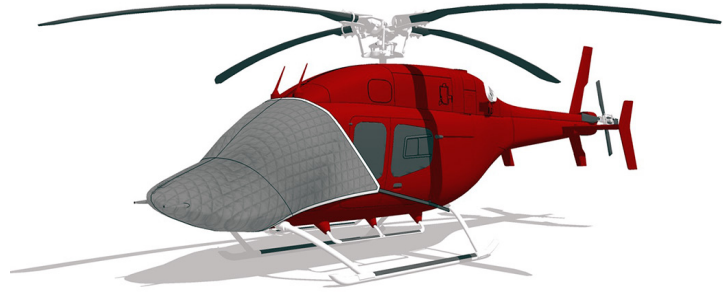
Bell 429 Insulated Cockpit/Nose Cover