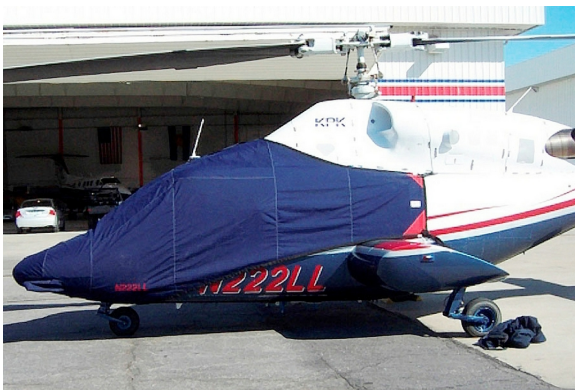
Bell 222 Bubble Cover

This cover type is made from Silver Acrylic Sunbrella canvas and is 100% lined with a soft and smooth microfiber. Bruce's Custom Covers developed this material combination especially for aircraft protection. The outer material is medium weight and treated for water resistance, UV resistance and anti-static buildup. The inner lining is a very soft and smooth microfiber to prevent scratching. The material is very reflective, and tests show that the cabin interior temperature can be reduced to near-ambient temperature on the hottest of days. It is water, ice and snow repellent, yet breathable to allow moisture to escape from between the cover and the aircraft surface.