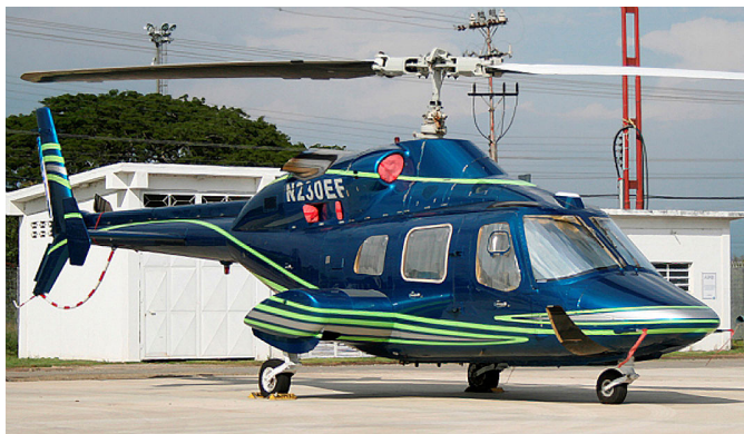
Bell 230 Engine Plugs, HeatShields