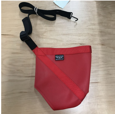
Prop Tie-Down, Various Models (secures with a hook to engine nacelle)

This cover type is made from Silver Acrylic Sunbrella canvas and is 100% lined with a soft and smooth microfiber. Bruce's Custom Covers developed this material combination especially for aircraft protection. The outer material is medium weight and treated for water resistance, UV resistance and anti-static buildup. The inner lining is a very soft and smooth microfiber to prevent scratching. The material is very reflective, and tests show that the cabin interior temperature can be reduced to near-ambient temperature on the hottest of days. It is water, ice and snow repellent, yet breathable to allow moisture to escape from between the cover and the aircraft surface.