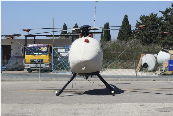
MD-500E Bubble Cover, Blade Tie-Downs