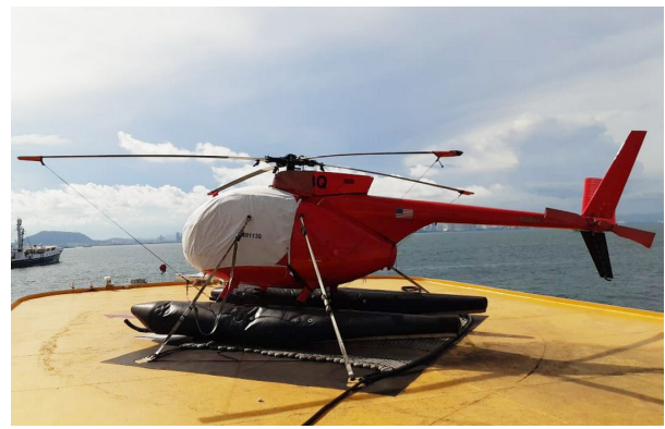
Hughes 500C (369HS) Bubble Cover, Blade Tie-Downs