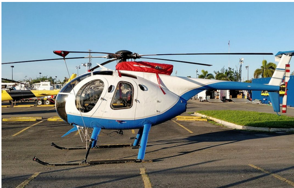
Hughes 500D Blade Tie-Downs, Doghouse Cover

WINTER USE MATERIAL - Made with Solution-Dyed Polyester fabric, this option is intended for seasonal use to aid in deicing, rain mitigation, or for occasional travel. The material is lighter and more compact, but more susceptible to UV damage and may have a shorter useful life if used continuously outside than the all-year use material.