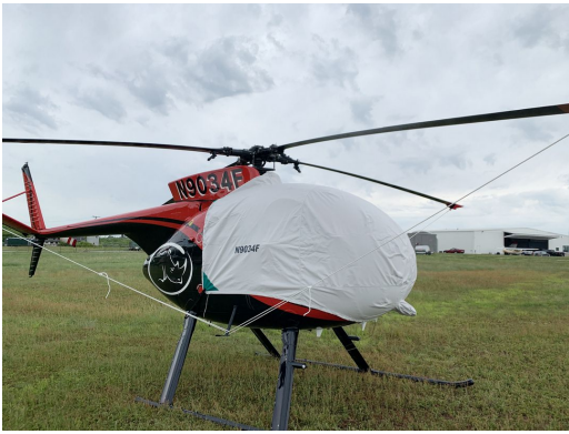
Hughes 500C Bubble Cover with Intake Add-On