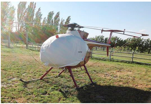
MD500D Bubble Cover with Intake Add-On