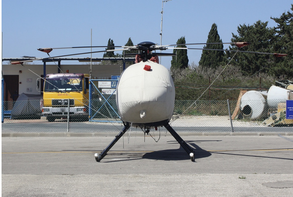
MD-500E Bubble Cover, Blade Tie-Downs

WINTER USE MATERIAL - Made with Solution-Dyed Polyester fabric, this option is intended for seasonal use to aid in deicing, rain mitigation, or for occasional travel. The material is lighter and more compact, but more susceptible to UV damage and may have a shorter useful life if used continuously outside than the all-year use material.