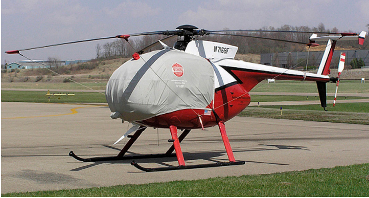
Hughes 500D Bubble Cover with Wire Strike detail and Blade Tie-downs

Travel Covers are made with Silver Solution-Dyed Polyester fabric and fully lined over the entire cover. The material is lightweight and more compact for easy stowage in the aircraft. The polyester material is water resistant, but only intended for occasional use outside. We also have an ultra lightweight material available for fitted hangar dust covers. For daily outdoor use, the non-travel Sunbrella Cover is the best choice.