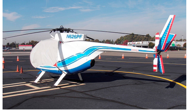
MD500C Bubble Cover with Wire Strike detail