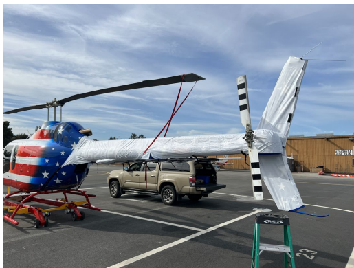
Bell 505 Tailboom & Stabilizer Covers, test fit cover