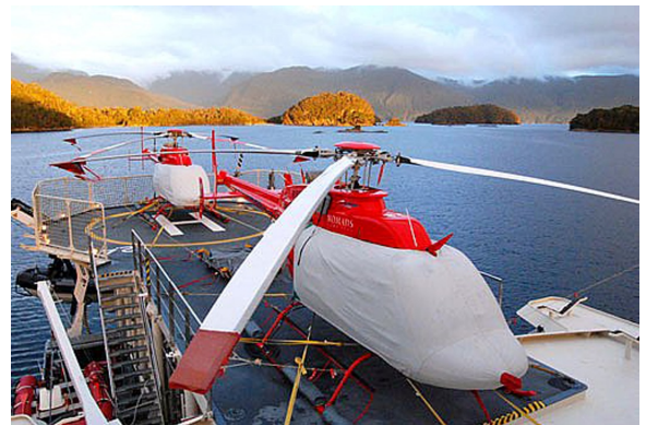
Bell 407 Bubble Cover