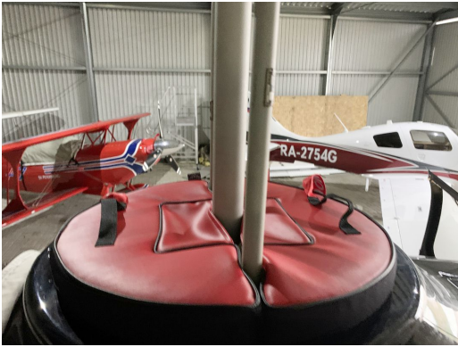
Bell 505 Jet Ranger X Swash Plate Plug

The Engine Inlet Plugs are custom fit for your Bell 505 Jet Ranger X intakes, made with heavy-duty vinyl material, and stuffed with a single block of sculpted urethane foam. Each plug has a zipper that allows the foam to be removed and dried if necessary. Engine plugs have 'Remove Before Flight' streamers sewn onto the face of the plugs. Most plugs are imprinted with the aircraft registration number in black for an extra charge. Storage bag NOT included. Engine plugs may be inserted after flight when the engine is still warm. Engine Inlet Plugs are commonly referred to as Cowl Plugs, Intake Plugs, Cowl Blocks, Engine Blocks, and Engine Bungs.