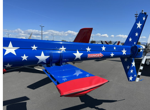
Bell 505 Horizontal Stabilizer Tip Pads