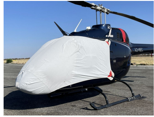
Bell 505 Bubble Cover, with Wire Strike