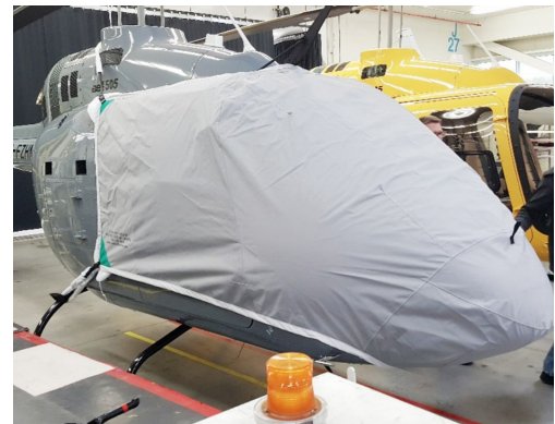
Bell 505 Bubble Cover, travel weight type