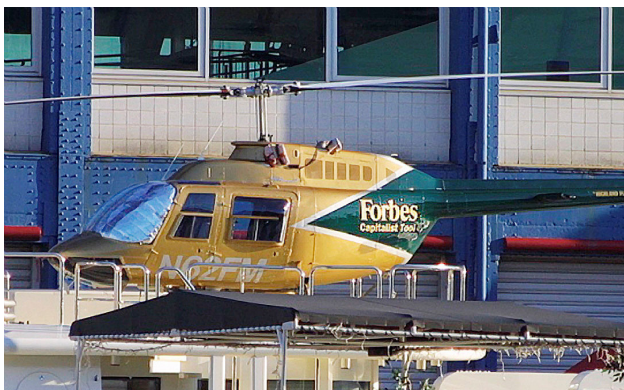
Bell 206B Jetranger Windshield HeatShields

Heatshields are interior sunshades for an aircraft's windows or canopy glass. The product is a unique composite of closed-cell foam with a silver mylar finish. The semi-rigid design is stiff enough to stand along the inside of the windshield using sun visors or window framing. It folds up flat and easily stores in the included storage sleeve. Some designs may require velcro and suction cups. A Heatshield is an excellent short-term remedy for cockpit overheating.