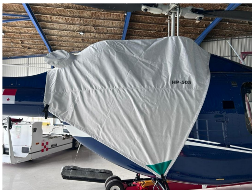
Bell 505 Engine Cover

WINTER USE MATERIAL - Made with Solution-Dyed Polyester fabric, this option is intended for seasonal use to aid in deicing, rain mitigation, or for occasional travel. The material is lighter and more compact, but more susceptible to UV damage and may have a shorter useful life if used continuously outside than the all-year use material.