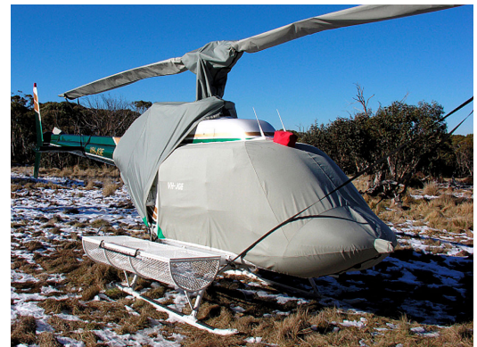
JetRanger Bubble, Engine, Rotor Hub & Blade Covers (& Tie-Downs)