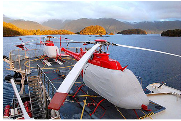
Bell 407 Bubble Cover