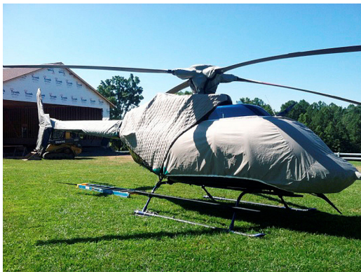
Bell 407 Covers: Bubble, Insulated Engine, Rotor Mast, Blades, Tailboom, Vertical Stabilizer and Tail Rotor

WINTER USE MATERIAL - Made with Solution-Dyed Polyester fabric, this option is intended for seasonal use to aid in deicing, rain mitigation, or for occasional travel. The material is lighter and more compact, but more susceptible to UV damage and may have a shorter useful life if used continuously outside than the all-year use material.