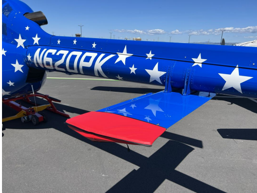
Bell 505 Horizontal Stabilizer Tip Pads

Designed to prevent damage to the aircraft extremities in crowded hangars, these products are made of bright red Naugahyde and thickly padded with a sandwich of closed cell foam.