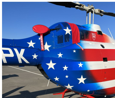
Bell 505 Exhaust & Intake Filter Covers