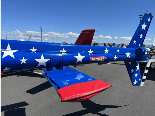
Bell 505 Horizontal Stabilizer Tip Pads

Designed to prevent damage to the aircraft extremities in crowded hangars, these products are made of bright red Naugahyde and thickly padded with a sandwich of closed cell foam.