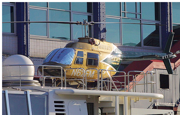
Bell 206B Jetranger Windshield HeatShields