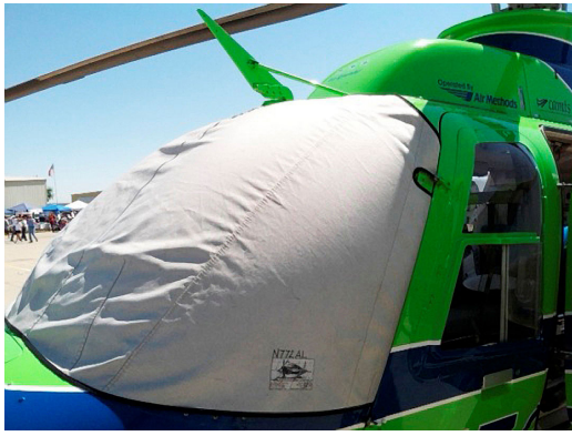
Bell 407 Windshield Cover