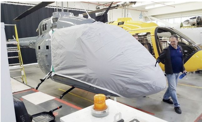
Bell 505 Bubble Cover

Travel Covers are made with Silver Solution-Dyed Polyester fabric and fully lined over the entire cover. The material is lightweight and more compact for easy storage in the aircraft. The polyester material is water resistant, but only intended for occasional use outside. We also have an ultra lightweight material available for fitted hangar dust covers. For daily outdoor use, the non-travel Sunbrella Cover is the best choice.