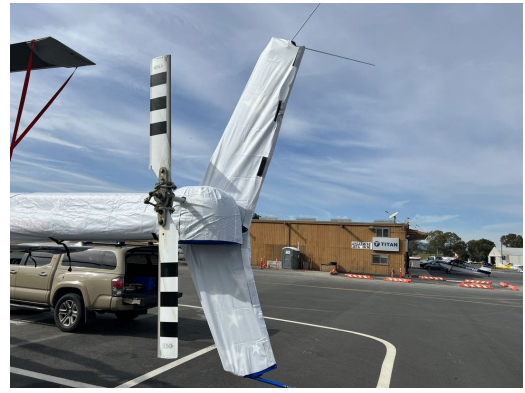
Bell 505 Tailboom & Stabilizer Covers, test fit cover