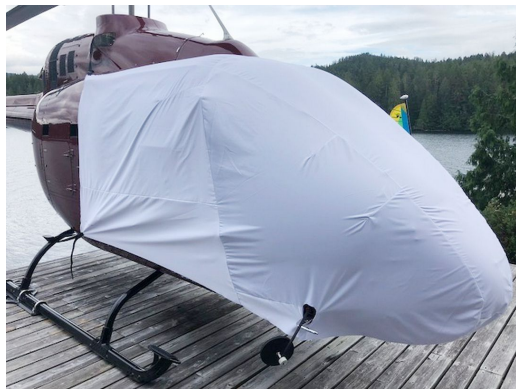
Bell 505 Bubble Cover, test fit cover

Travel Covers are made with Silver Solution-Dyed Polyester fabric and fully lined over the entire cover. The material is lightweight and more compact for easy storage in the aircraft. The polyester material is water resistant, but only intended for occasional use outside. We also have an ultra lightweight material available for fitted hangar dust covers. For daily outdoor use, the non-travel Sunbrella Cover is the best choice.