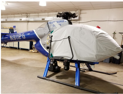
McDonnell Douglas MDD 520 Notar Bubble Cover, with special missions equipment.