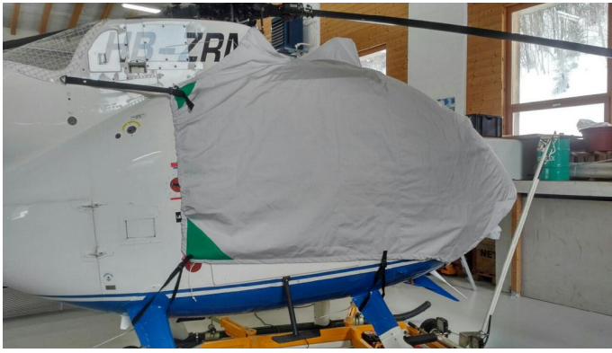
MD520 Bubble Cover with Intake Cover Add-On