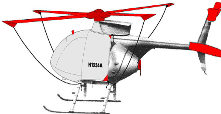
Full Cover Set

The Tailboom Cover details vary by model, but generally the helicopter tail boom cover encloses the tail boom from the "bottleneck" to the aft end. They usually also cover the horizontal stabilizers, and are custom made to allow for antennae, lights, and other protrusions. They attach with straps underneath the tail boom. Covers for the vertical and horizontal stabilizers are also available separately. Specific information for each model is available on request.