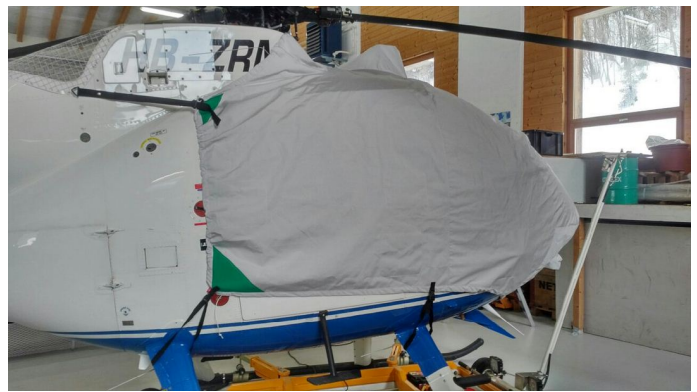
MD520 Bubble Cover with Intake Cover Add-On