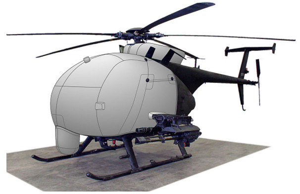
MDD 520 NOTAR Bubble Cover w/Intake Cover Add-On, Exhaust Cover MH-6J Bubble, Flir & Doghouse Covers (illustration)