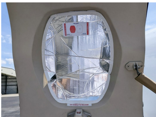
Citationjet Entrance Door Heatshield

Custom-made Heatshield Sunshades are available for almost any window in the jet. Side windows, Skylights, and Emergency Exits are all custom-made. The product is a unique composite of closed-cell foam with a silver mylar finish. The set is easily stored in the included storage sleeve. Some designs may require velcro and suction cups. Our Heatshields are offered white side out since aircraft manufacturers have issued advisories against reflective window inserts due to potential heat damage.