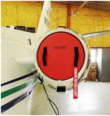
Cessna Citation S2 Intake Plugs