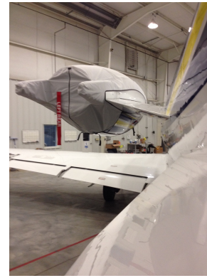
Cessna Citation 560XL Upper Nacelle/Brightwork Covers