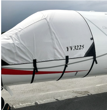
Cessna Citationjet V Ultra (560) Cockpit Cover

This cover type is made from Silver Acrylic Sunbrella canvas and is 100% lined with a soft and smooth microfiber. Bruce's Custom Covers developed this material combination especially for aircraft protection. The outer material is medium weight and treated for water resistance, UV resistance and anti-static buildup. The inner lining is a very soft and smooth microfiber to prevent scratching. The material is very reflective, and tests show that the cabin interior temperature can be reduced to near-ambient temperature on the hottest of days. It is water, ice and snow repellent, yet breathable to allow moisture to escape from between the cover and the aircraft surface.