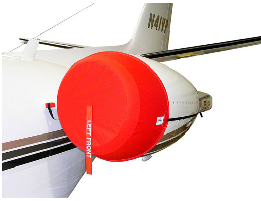
Citation Encore Intake Cover Set