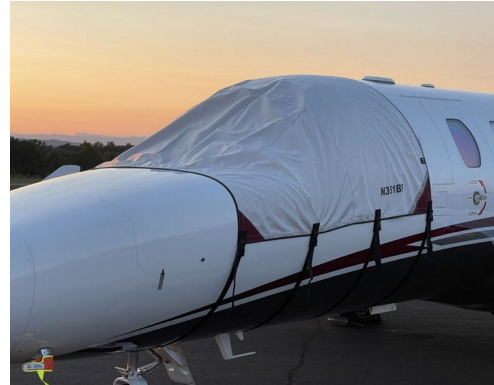
Cessna Citation Jet 525 Cockpit Cover