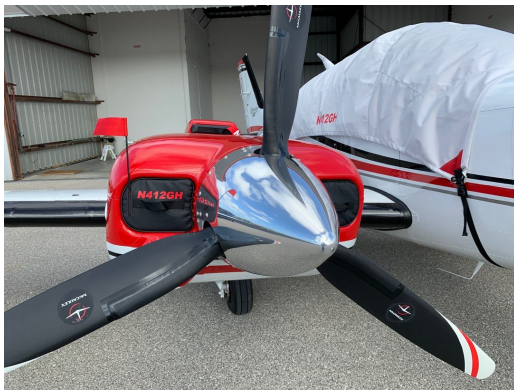
Beech Baron G58 Engine Inlet Plugs

Engine Inlet Plugs are custom fit for your Beech Baron 58P intakes, made with heavy-duty vinyl material, and stuffed with a single block of sculpted urethane foam. Each plug has a zipper that allows the foam to be removed and dried if necessary. Engine plugs have warning flags that are visible from the cockpit or 'remove before flight' streamers sewn onto the face of the plugs. Most plugs are imprinted with the aircraft registration number in black for an extra charge. Storage bag NOT included. Engine plugs may be inserted after flight when the engine is still warm. Engine Inlet Plugs are commonly referred to as Cowl Plugs, Intake Plugs, Cowl Blocks, Engine Blocks, and Engine Bungs.