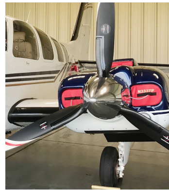
Beech Baron 58 Engine Inlet Plugs & Cowl Top Plug