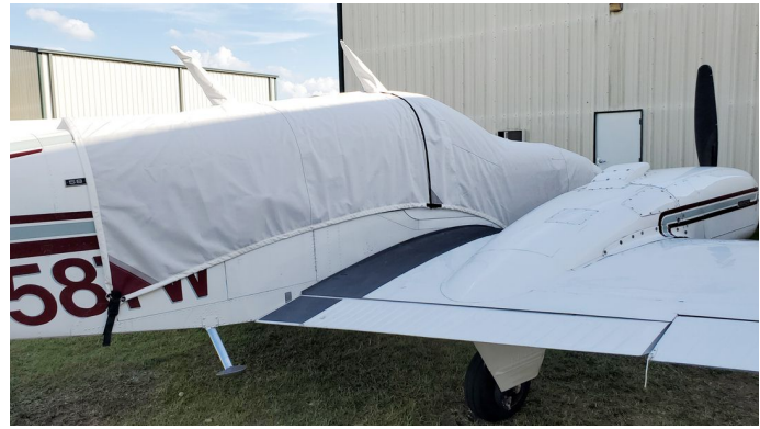
Beech Baron 58 Canopy/Nose Cover