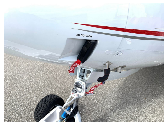
Beech Baron G58 Nose Inlet Plug