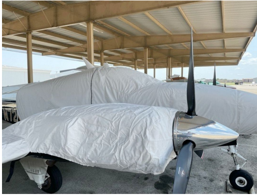
Beech Baron 58P Extended Canopy/Nose Cover, Wing/Engine Covers (test fit)

WINTER USE MATERIAL - Made with Solution-Dyed Polyester fabric, this option is intended for seasonal use to aid in deicing, rain mitigation, or for occasional travel. The material is lighter and more compact, but more susceptible to UV damage and may have a shorter useful life if used continuously outside than the all-year use material.