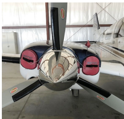
Beech Baron 58P Engine Inlet Plugs

Engine Inlet Plugs are custom fit for your Beech Baron 58TC intakes, made with heavy-duty vinyl material, and stuffed with a single block of sculpted urethane foam. Each plug has a zipper that allows the foam to be removed and dried if necessary. Engine plugs have warning flags that are visible from the cockpit or 'remove before flight' streamers sewn onto the face of the plugs. Most plugs are imprinted with the aircraft registration number in black for an extra charge. Storage bag NOT included. Engine plugs may be inserted after flight when the engine is still warm. Engine Inlet Plugs are commonly referred to as Cowl Plugs, Intake Plugs, Cowl Blocks, Engine Blocks, and Engine Bungs.