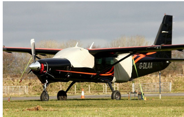
Cessna Caravan Cockpit Cover, Engine Plugs, Jump Door Cover