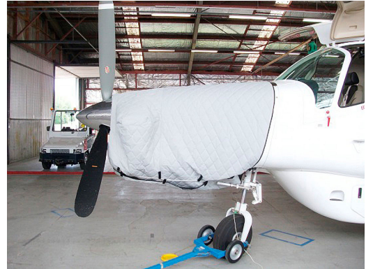
750XL Insulated Engine Cover