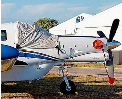
750XL Cockpit Cover & Prop Tie/Exhaust Covers

This cover type is made from Silver Acrylic Sunbrella canvas and is 100% lined with a soft and smooth microfiber. Bruce's Custom Covers developed this material combination especially for aircraft protection. The outer material is medium weight and treated for water resistance, UV resistance and anti-static buildup. The inner lining is a very soft and smooth microfiber to prevent scratching. The material is very reflective, and tests show that the cabin interior temperature can be reduced to near-ambient temperature on the hottest of days. It is water, ice and snow repellent, yet breathable to allow moisture to escape from between the cover and the aircraft surface.