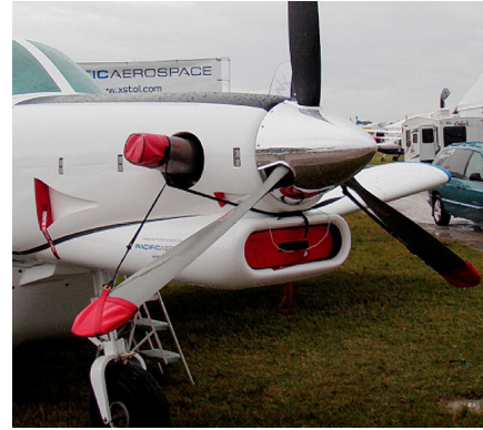
750XL Engine Inlet Plugs & Prop Tie/Exhaust Covers