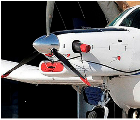
750XL Engine Inlet Plugs & Prop Tie/Exhaust Covers