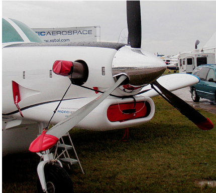
750XL Engine Inlet Plugs & Prop Tie/Exhaust Covers

This cover type is made from Silver Acrylic Sunbrella canvas and is 100% lined with a soft and smooth microfiber. Bruce's Custom Covers developed this material combination especially for aircraft protection. The outer material is medium weight and treated for water resistance, UV resistance and anti-static buildup. The inner lining is a very soft and smooth microfiber to prevent scratching. The material is very reflective, and tests show that the cabin interior temperature can be reduced to near-ambient temperature on the hottest of days. It is water, ice and snow repellent, yet breathable to allow moisture to escape from between the cover and the aircraft surface.