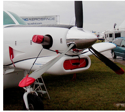
750XL Engine Inlet Plugs & Prop Tie/Exhaust Covers